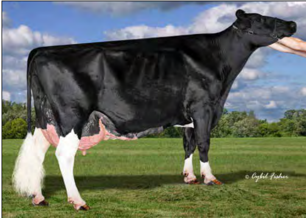
RC-LC GOLD CHIP KOZY-ET EX-94 EEEEE 2E DAM OF LOT M