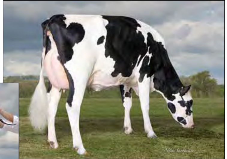
RICHMOND-FD S BARBARA-ET EX-90 DOM 5TH DAM OF LOT 11G