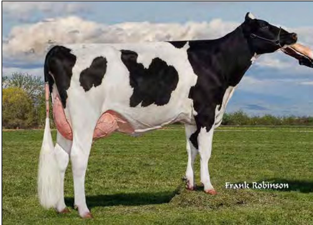
CAL-ROY-AI JENNIE 4713-ET VG-87 VG-MS 3RD DAM OF LOT 24G