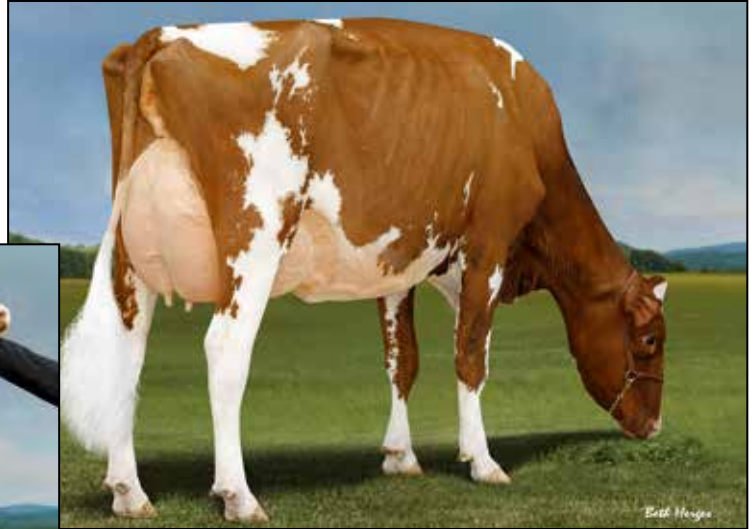
WINDY-KNOLL-VIEW PHIREY-RED EX-92 MAX 94-MS SELLS AS LOT 8