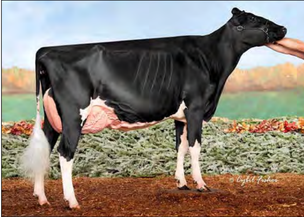
MS APPLE ARRIE-ET EX-93 FULL SISTER TO 2ND DAM OF LOT 28 & FULL SISTER TO DAM OF LOT 27