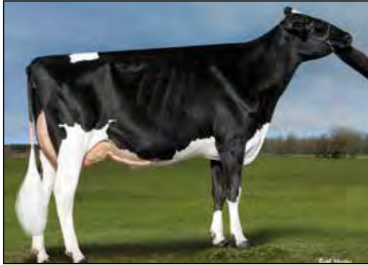
ENDCO DIAMOND BEAUTY-ET EX-91 EEEEE DAM OF LOT 15