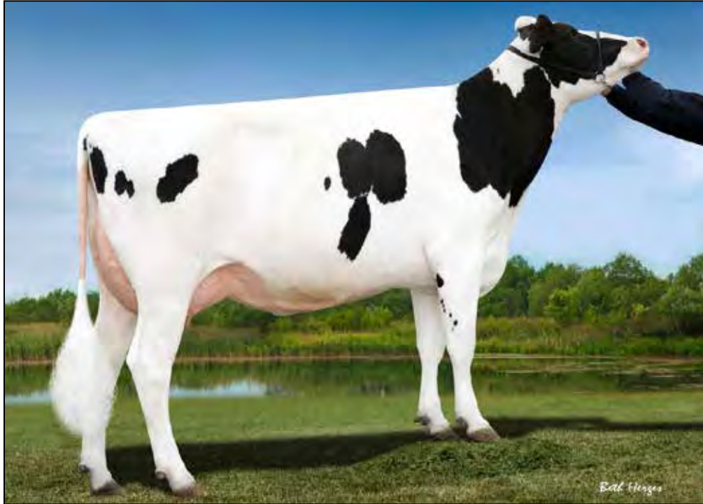
SWAMPY-HOLLOW HOPE 4TH DAM OF LOT 16G