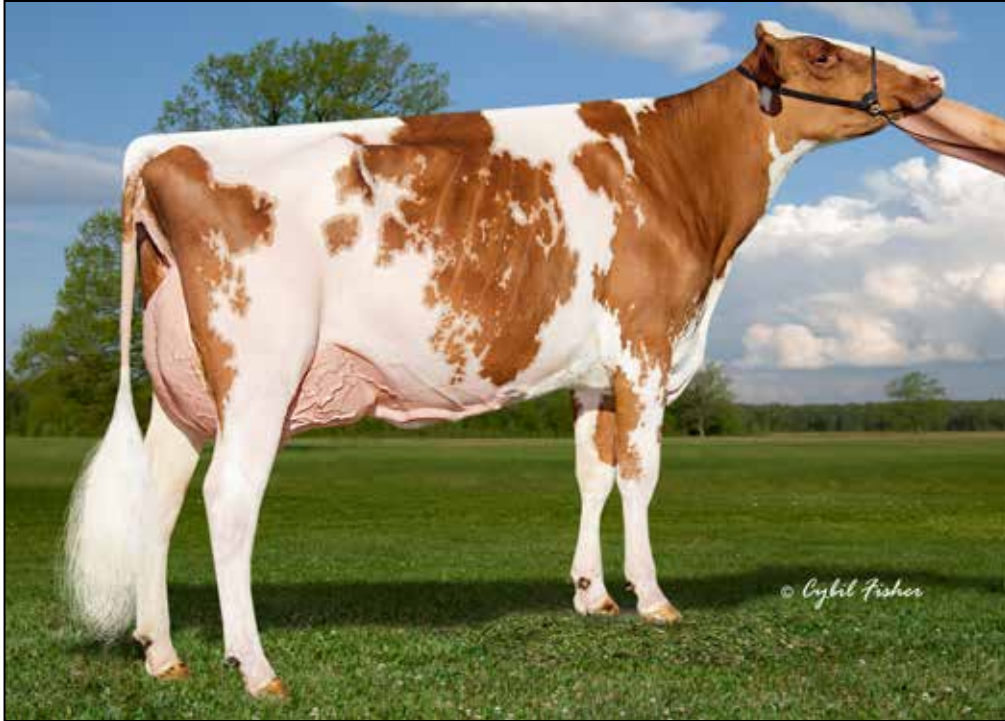
ARB-FLO-SPR HONEYBUN-RED-ET EX-92 EX-MS DAM OF LOT B