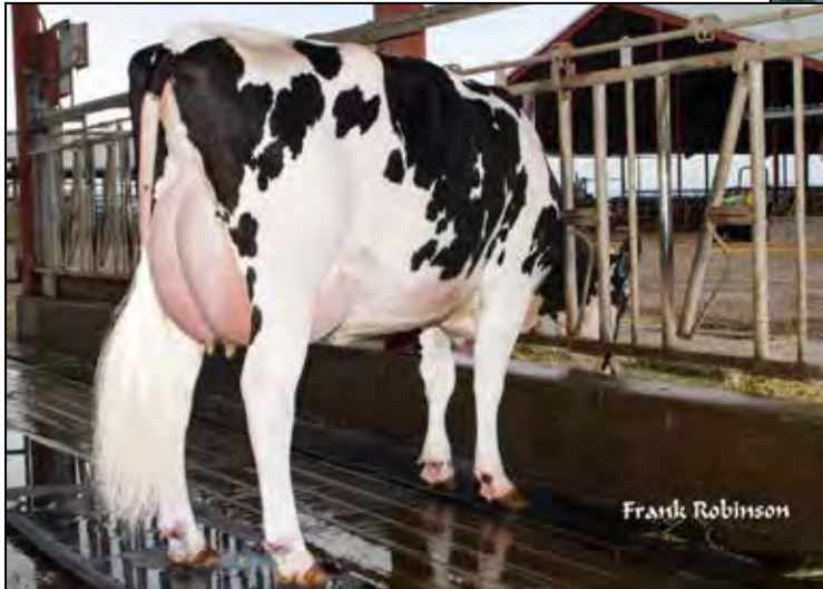
CALORI-D CRS JOSPR MOLEY-ET VG-85 VG-MS 3RD DAM OF LOT 17G