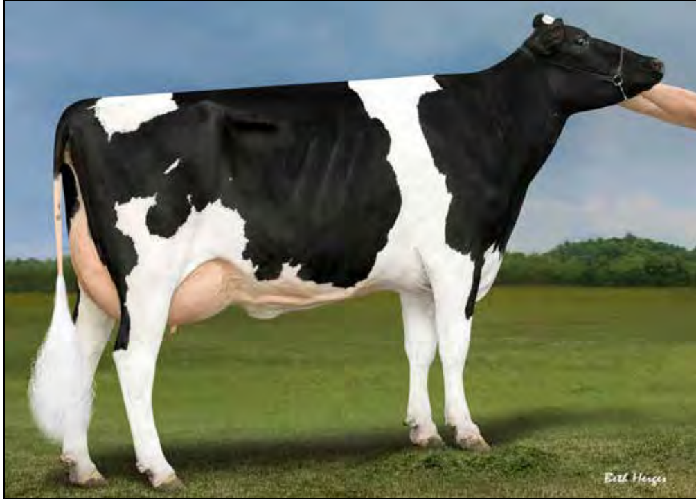
BLUMENFELD TOPSHOT 5815-ET GP-83 VG-MS 3RD DAM OF LOT 8G