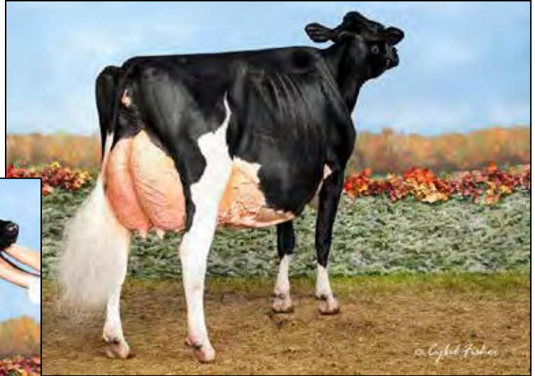
ROSIER BLEXY GOLDWYN-ET EX-97 EEEEE 3E 2ND DAM OF LOT 1