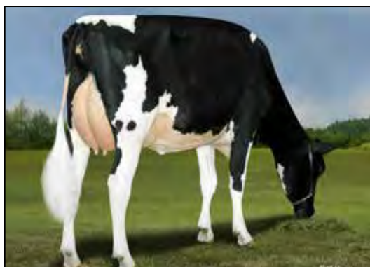
BLEXY'S CRSH BLACK CHERRY-ET VG-86 87-MS @ 2-05 DAM OF LOT 9