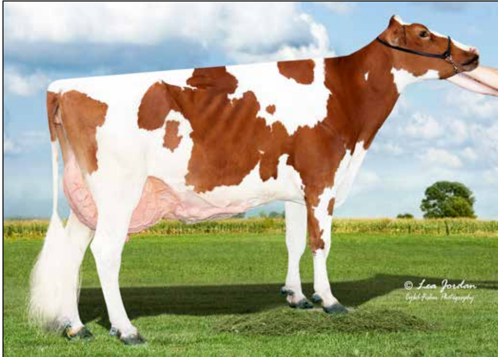
SCENERY-VIEW CELIA-RED-ET EX-91 EX-MS *PO 4TH DAM OF LOT 14G