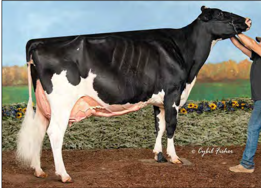
WINDY-KNOLL-VIEW PANINI-ET EX-95 EEEEE 2E DAM OF LOT 4