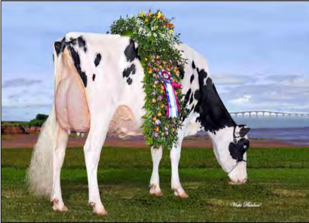
IDEE WINDBROOK LYNZI EX-95-CAN 95-MS 2E FULL/MATERNAL SISTER TO LOT K