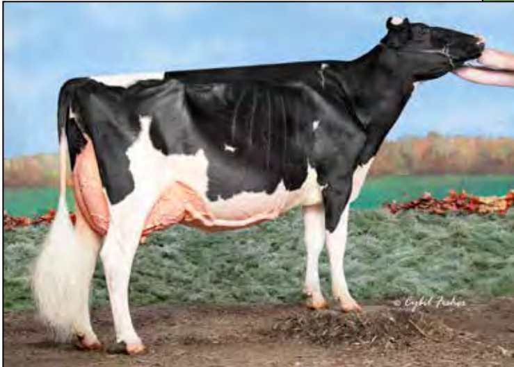
KEVETTA DANIEL LEXI EX-92 MATERNAL SISTER TO LOT L