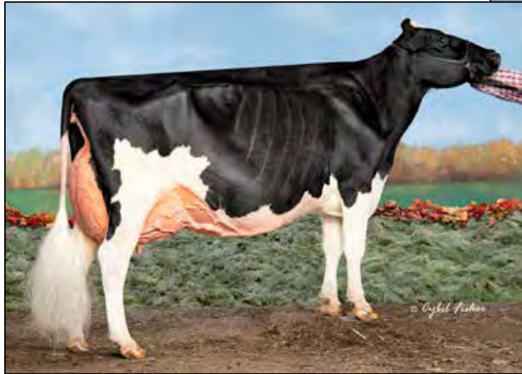
POSTHAVEN ABSOLUTE SASY EX-96 EEEEE 2E DAM OF LOT 23