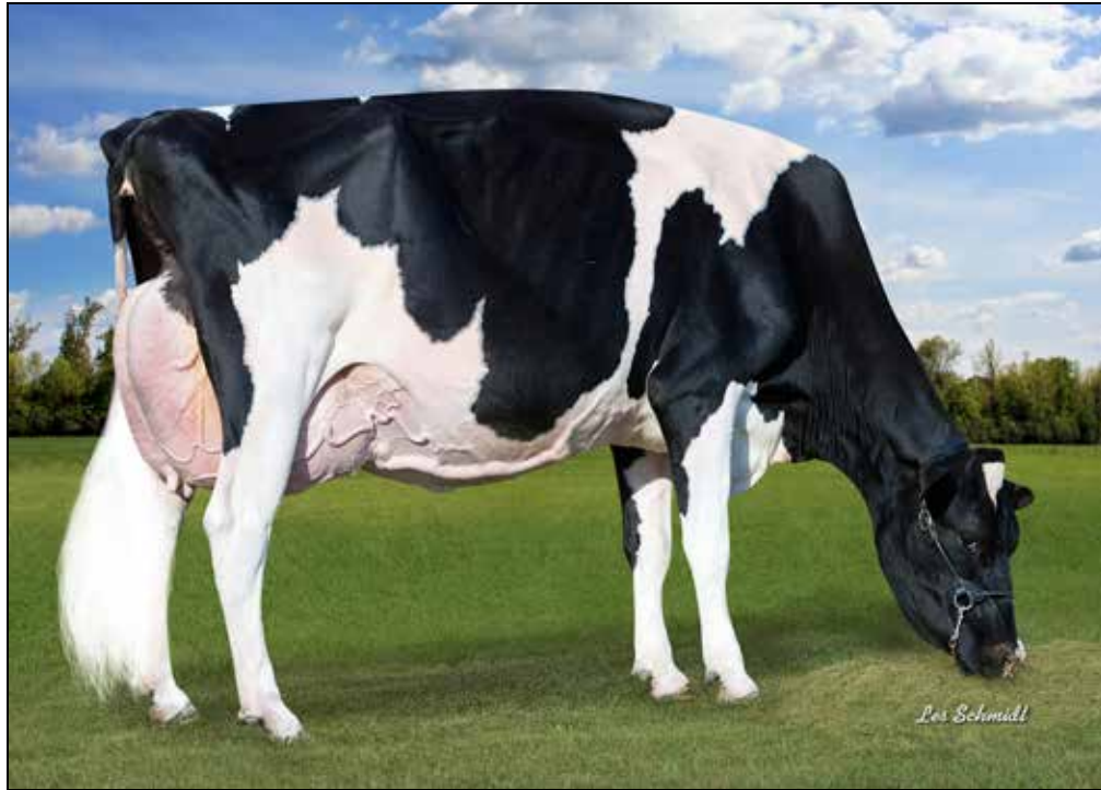
TEAM DURHAM MORGAN-ET EX-96 97-MS 4E DAM OF LOT 43