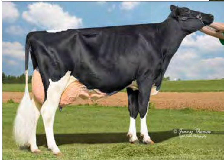
MS APPLE ARRIELLA-ET EX-92 EEEEE DAM OF LOT 27