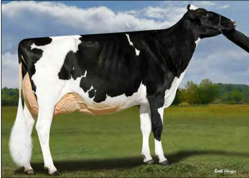
IDEE DOORMAN LYSA EX-94 EEEEE MAX DAM OF LOT 37