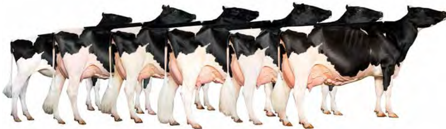
J&K-VUE GOLDWYN GLAMOUR-ET EX-96 EEEEE 3E DAM OF LOT 2