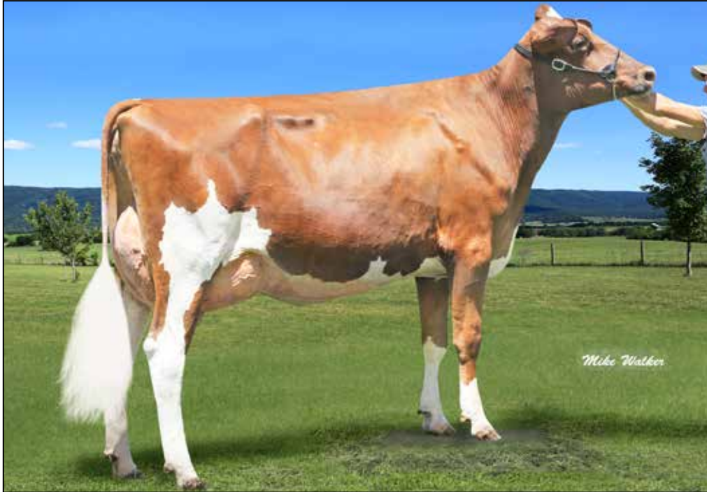
SUNSPARK APPLE CRUMBLE-RED-ET EX-92 EX-MS 2E DAM OF LOT 29