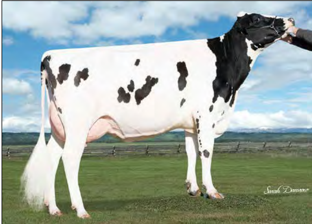
TRIPLECROWN JW OFEST 142-ET VG-87 VG-MS 3RD DAM OF LOTS 30G & 19G