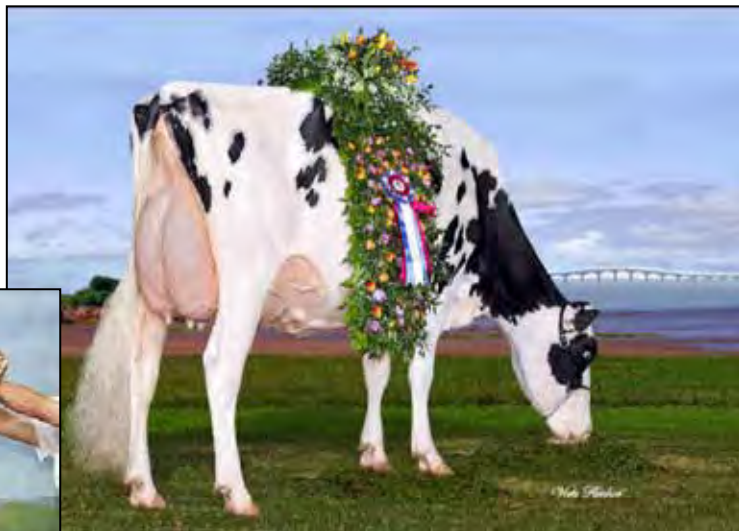
IDEE WINDBROOK LYNZI EX-95-CAN 2E MATERNAL SISTER TO LOT 38