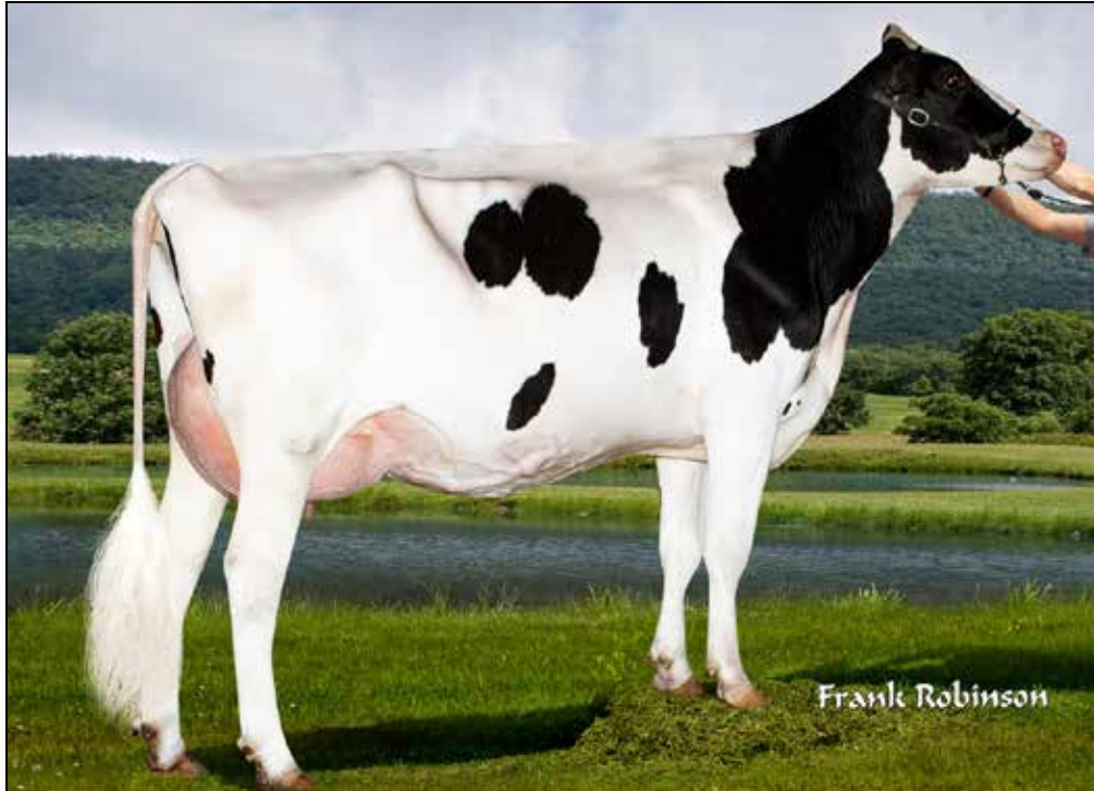
CHERRYPENCOL LEE-ET VG-88 VG-MS @ 2-11 2ND DAM OF LOT 28G