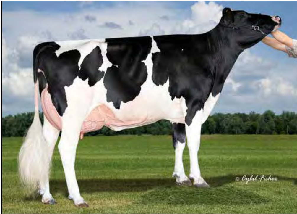
AOT SALVATORE HICCUP-ET VG-87 VG-MS 2ND DAM OF LOT 34G