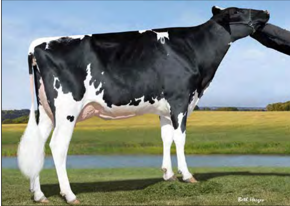
T-GEN-AC DEMZEL JANARDY-ET VG-89 EX-MS 4TH DAM OF LOT 5G