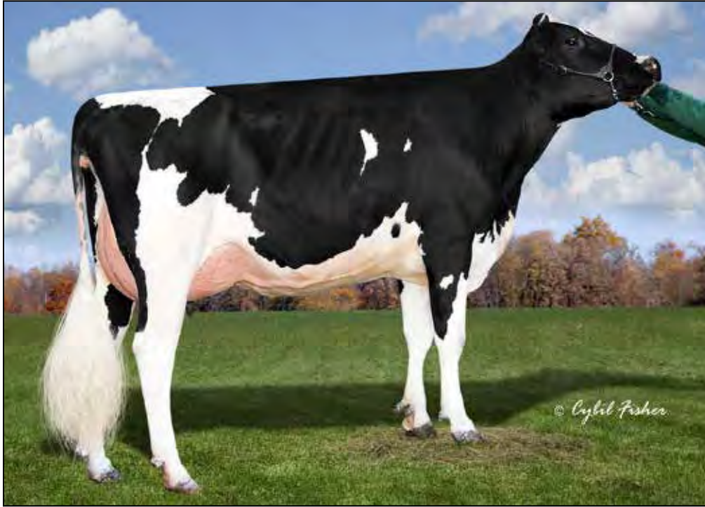
KINGS-RANSOM SSHT DAVERA-ET EX-91 EX-MS 3RD DAM OF LOT 21G