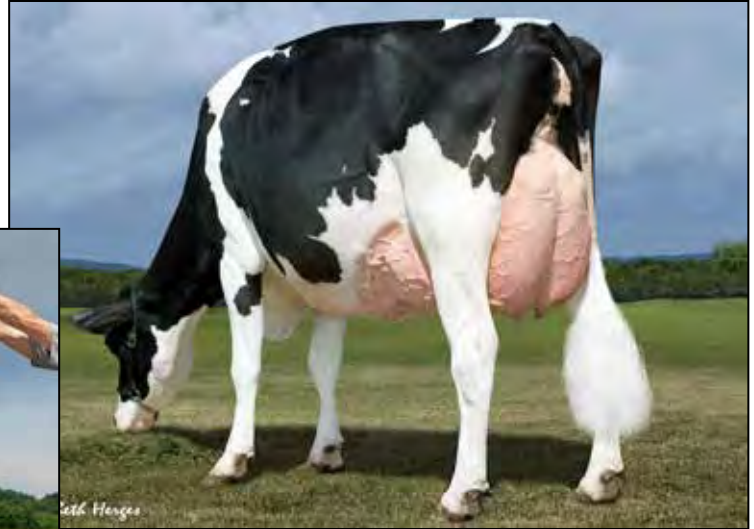
LUCK-E ADVENT ASIA-ET EX-94 EEEEE 3E 2ND DAM OF LOT 18