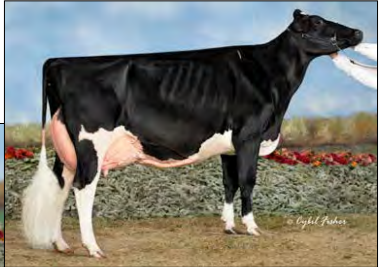
COOKVIEW GOLDWYN MONIQUE EX-95 3E DAM OF LOT 49