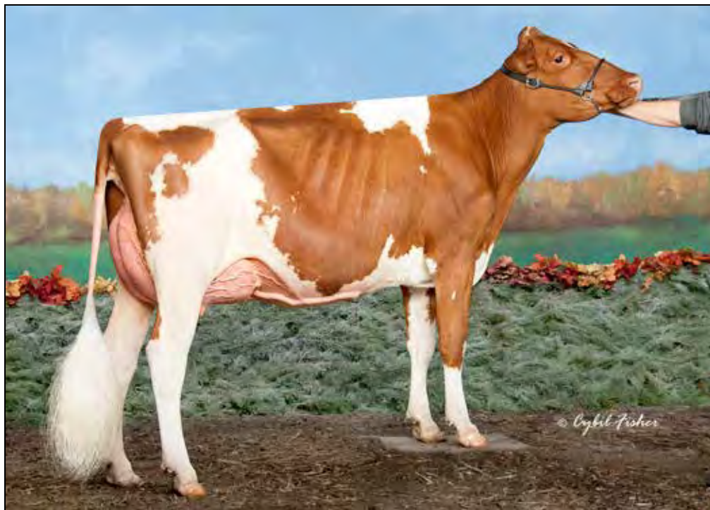
MS RANSOM-RAIL BETH-RED-ET VG-88 EX-MS DAM OF LOT C