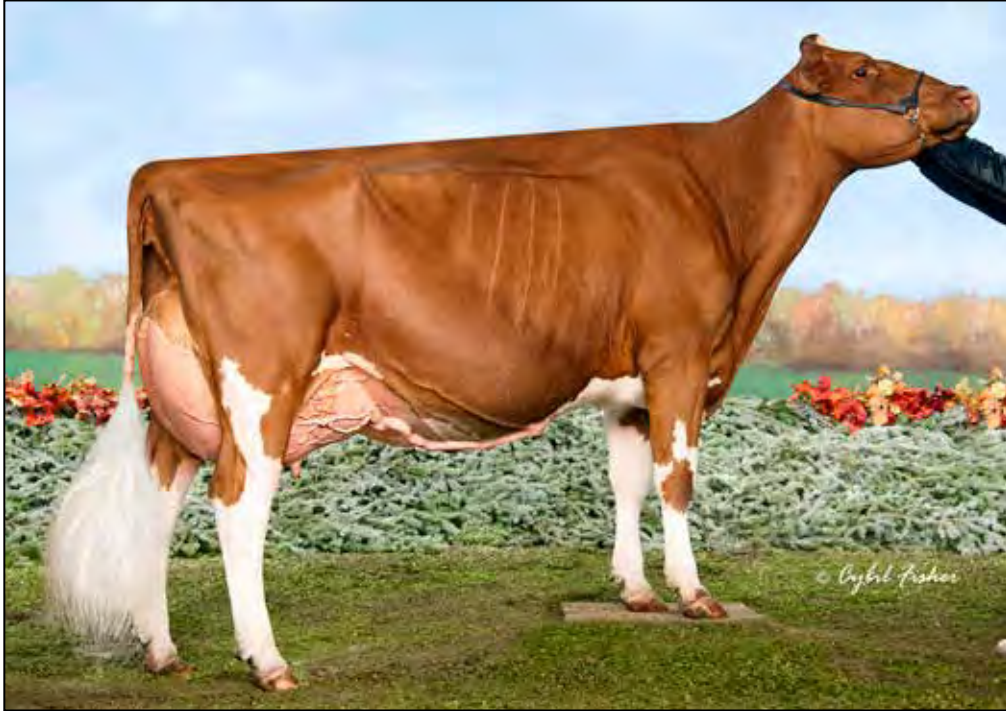
MEADOW GREEN ABSO FANNY-RED-ET EX-96 EEEEE 2E DAM OF LOT 36