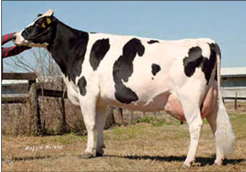
NO-FLA MASEY 30194-TW VG-85 5TH DAM OF LOT 6G