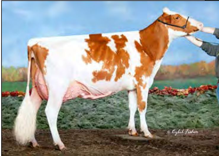
ST-JACOB DESTRY LAVA-RED-ET EX-92 EEEEE SELLS AS LOT 60