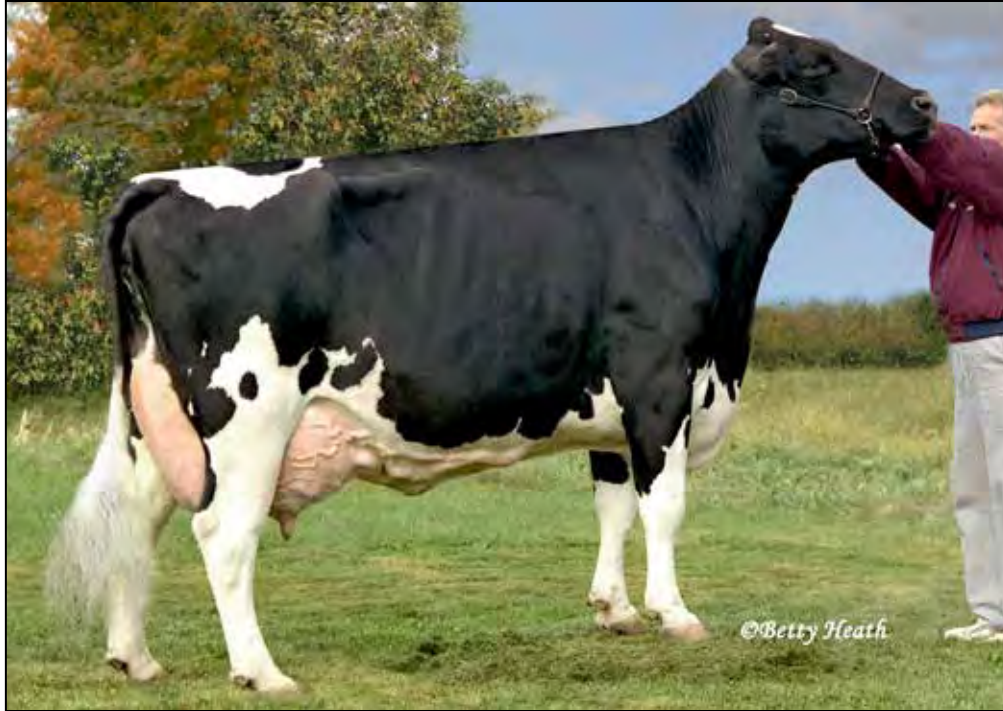
PENN-GATE SKYCHIEF FINESSE 2E-94 FULL SISTER TO 3RD DAM OF LOT 53