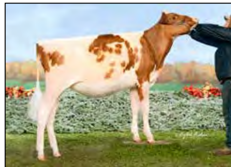
MILKSOURCE THUNDER-RED VG-88 FULL SISTER TO LOT 20

Full sister to Tranquility & Maternal sister to Tommygirl Milksource Thunder-Red-ET VG-88