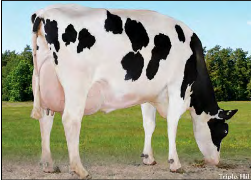
PINE-TREE ERA ACHIE 7593-ET GP-82 @ 3-00 2ND DAM OF LOT 12G