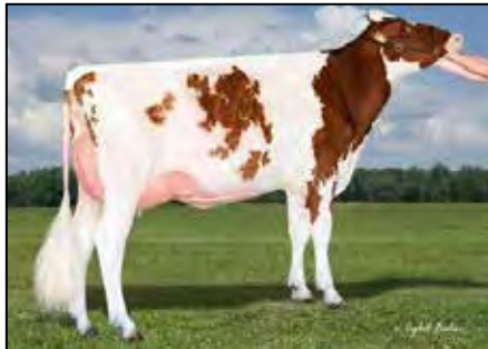
HILROSE AVALNCH ADDY-RED-ET VG-87 MATERNAL SISTER TO LOT 19