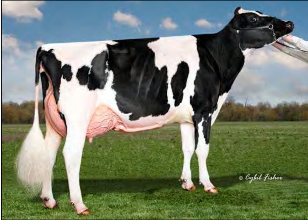
JACOBS IMPRESSION ROMAN-ET VG-89-CAN EX-MS @ 2-10 DAM OF LOT 11