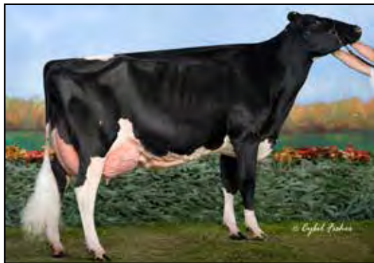
WINTERBAY GOLDWYN LOTTO EX-95 EEEEE 3RD DAM OF LOT 17