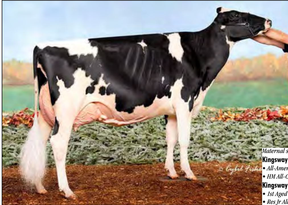
KINGSWAY DOORMAN ANDREA-ET EX-93 EEEEE DAM OF LOT 12