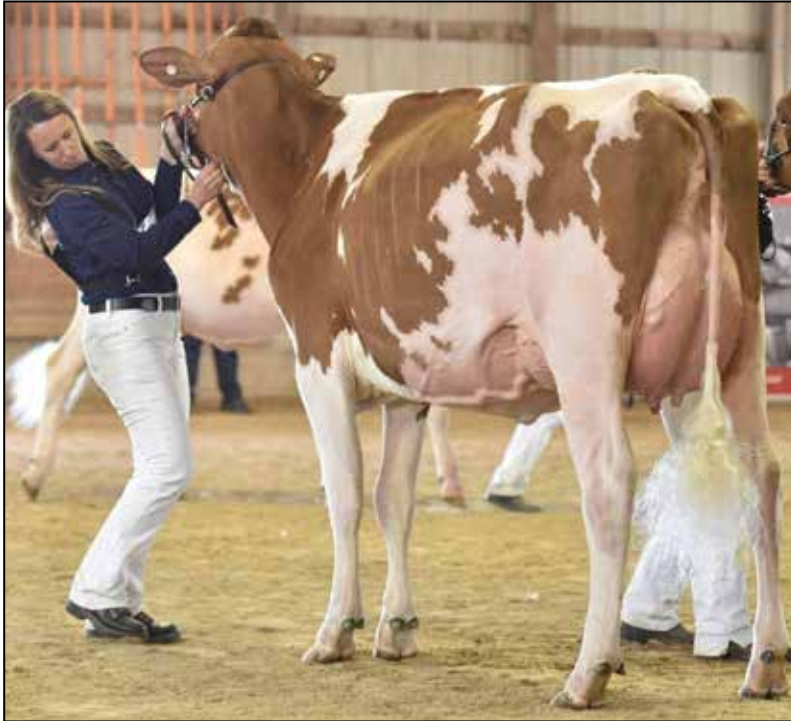
MILKSOURCE TANTRUM-RED-ET MATERNAL SISTER TO LOTS 20 & 22 FULL SISTER TO LOT 21