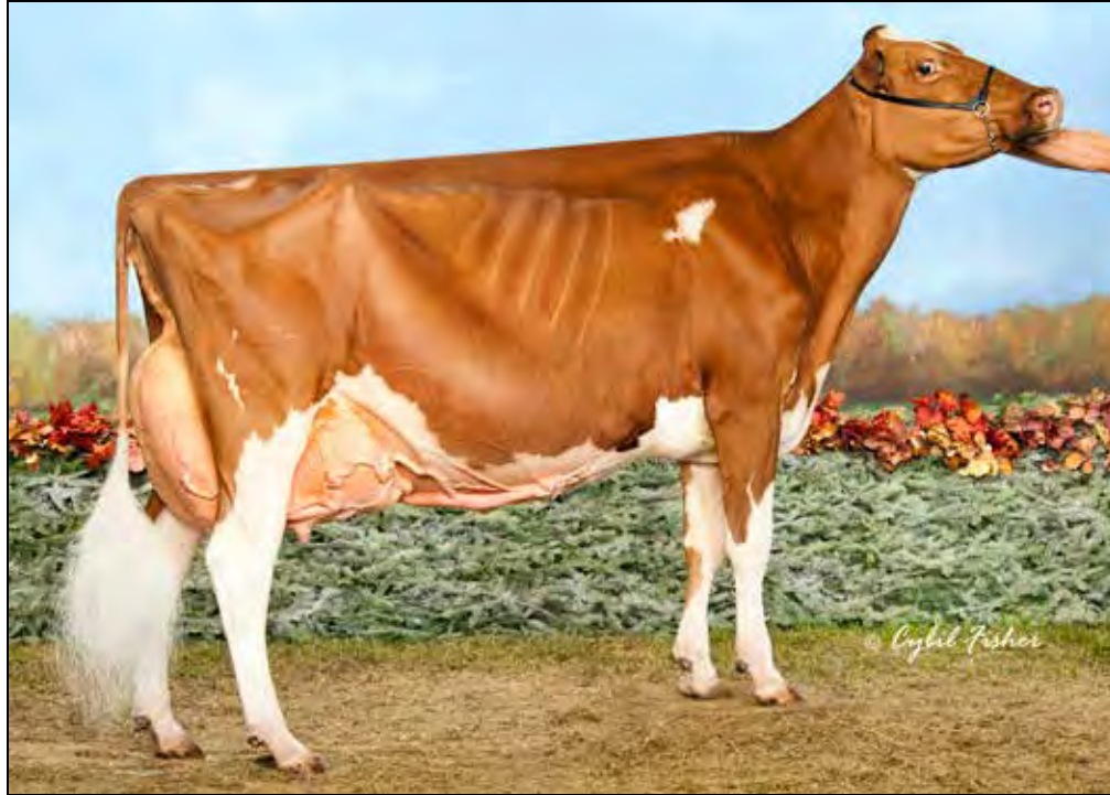
ROSEDALE LUCKY-ROSE-RED EX-94 EEEEE 2E DAM OF LOT 35