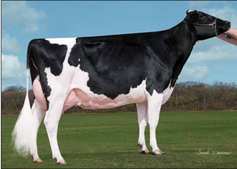
MISS CLARK CLAIR-ET EX-91 EX-MS 5TH DAM OF LOT 3G