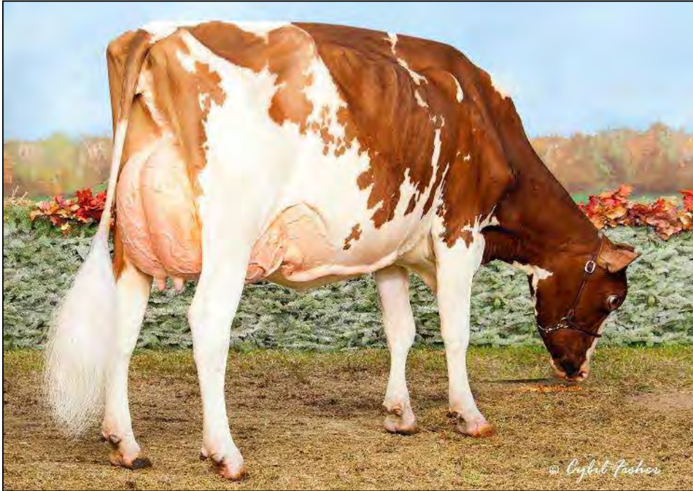
MS-AOL CNTNDR REVIVE-RED-ET EX-94 MATERNAL SISTER TO LOT 34