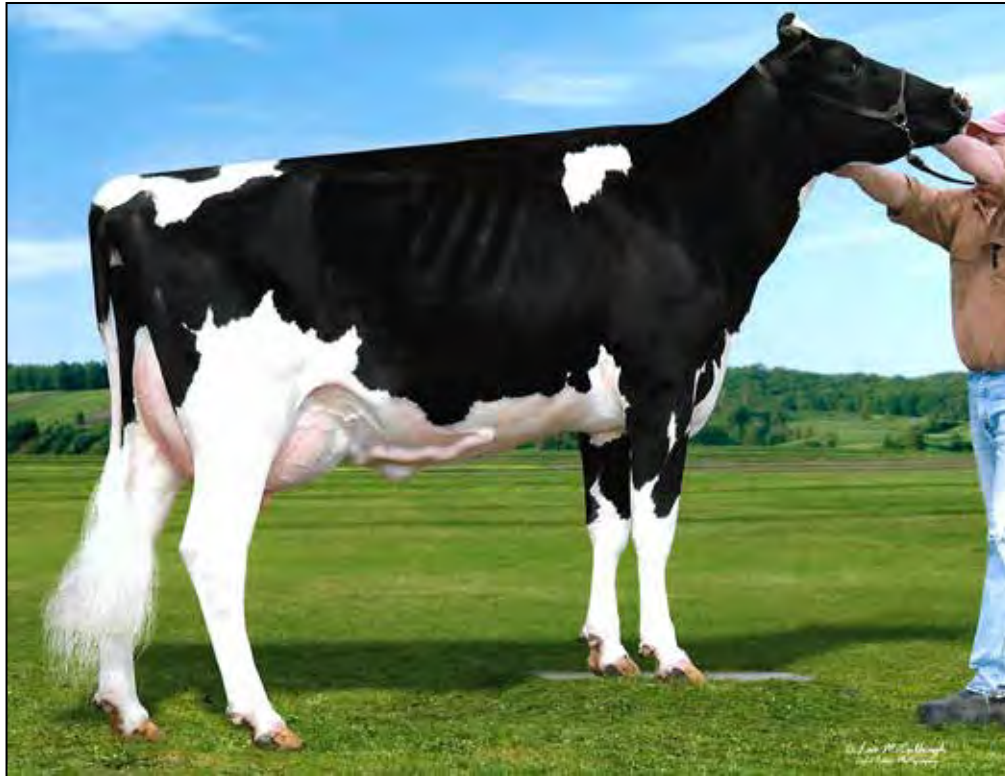
POTSDALE GOLDWYN ROZINA-ET EX-94 EEEEE 4E 2ND DAM OF LOT 50