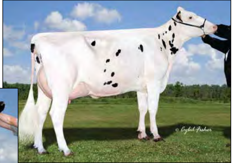
QUIET-BROOK-D BABYBOOK-ET EX-94 DOM 2E 5TH DAM OF LOT 1G