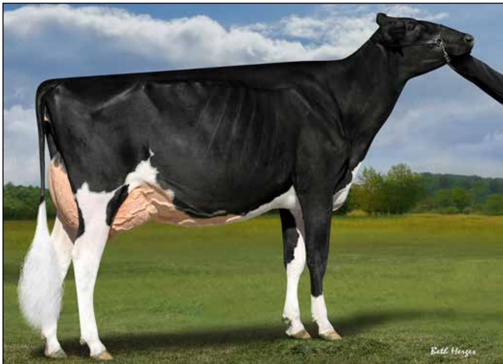
FRAELAND DOORMAN BONNIE EX-94 EX-MS DAM OF LOT J