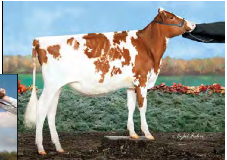
OAKFIELD US AVIVA-RED FULL SISTER TO LOT 6