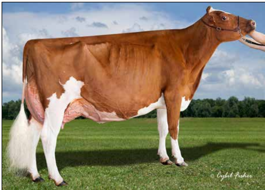
STRANS-JEN-D TEQUILA-RED-ET EX-96 EEEEE 2E DAM OF LOTS 20, 21 & 22