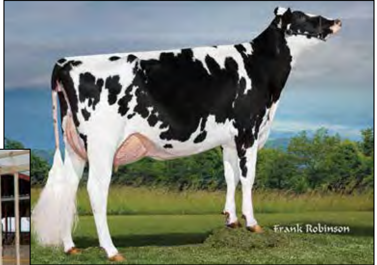
TRIPLECROWN UNO 602-ET EX-90 2E DOM 4TH DAM OF LOT 17G