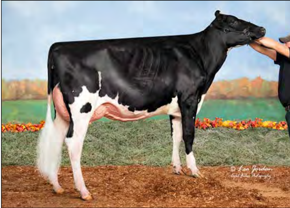
LANDIS-MRK JACOBY DILLY-D VG-87 EX-NS @ 2-05 DAM OF LOT G