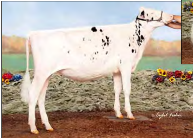
KEYSTONE SOLOMON ALLSTAR VG-85 VG-MS @ 2-05 DAM OF LOT 51