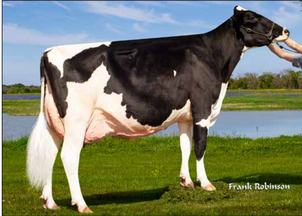
RUANN DUKE NORAIN-72204-ET VG-88 VG-MS 3RD DAM OF LOT 9G