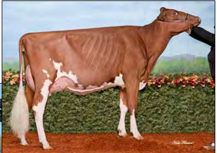
MS-AOL DB RASPBERRY-RED-ET VG-87-CAN MATERNAL SISTER TO LOT H