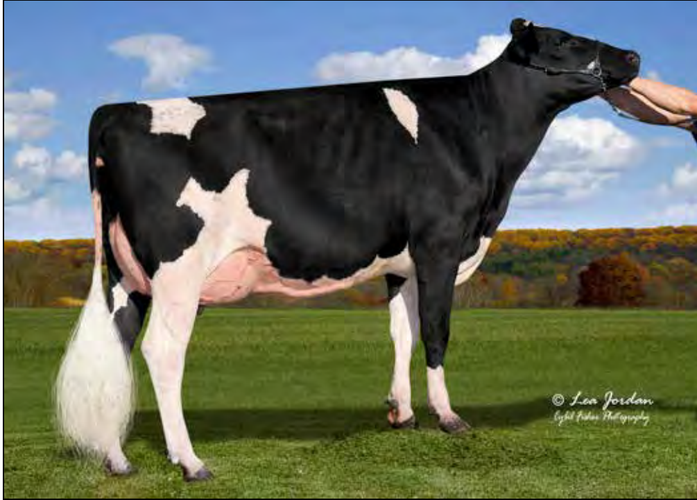
MIDAS-TOUCH HAROLDO 824 VG-85 VG-MS 2ND DAM OF LOT 31G