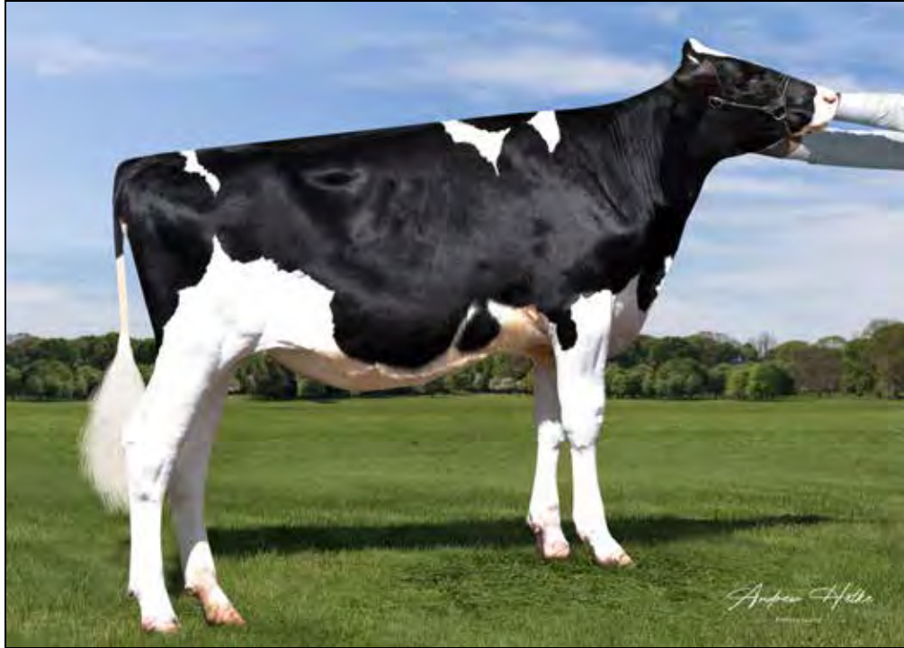
HOLLERMANN MAXIMUS 2115-ET DAM OF LOT 22G