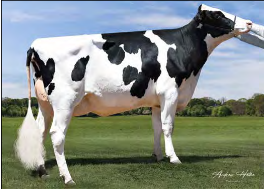
DANHOF RENEGADE DORA-ET VG-86 @ 2YRS 2ND DAM OF LOT 25G