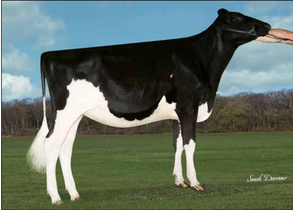
WHITEHEAD-RA DOORMN ALLSTAR SELLS AS LOT 47