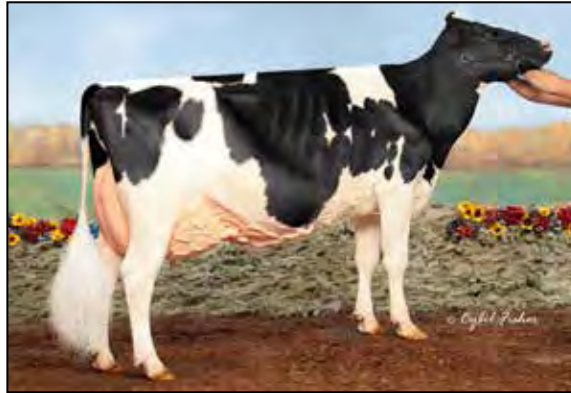
GOLDEN-ROSE ABS GINGER-ET EX-94 EX-MS DAM OF LOT 7