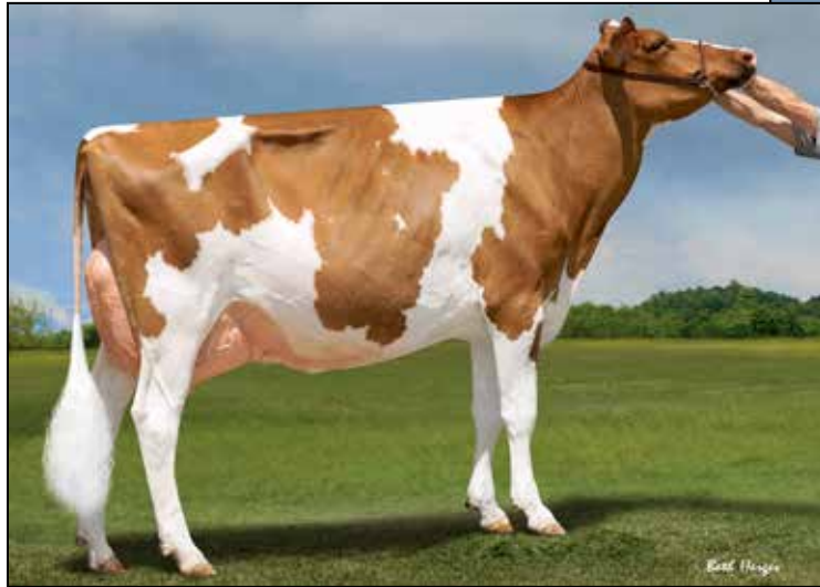
LUCK-E MCGUCCI AFRO-RED-ET EX-93 EEEEE DAM OF LOT 18