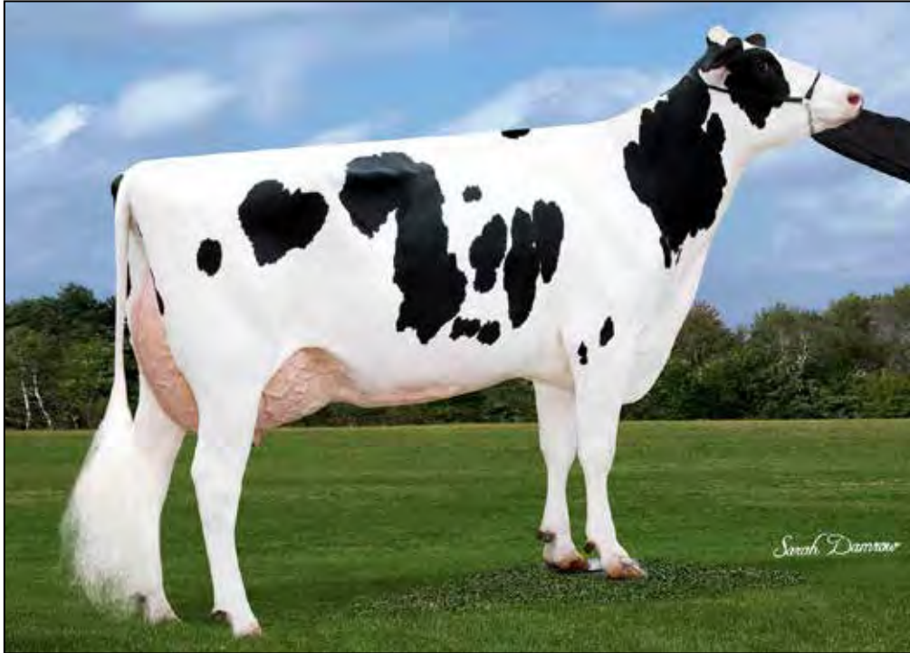
VATLAND SILVER LILY 4377 VG-87 EX-MS 4TH DAM OF LOT 26G