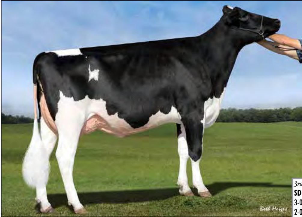
FARNEAR-TBR-BH CANDI-ET VG-86 4TH DAM OF LOT 29G