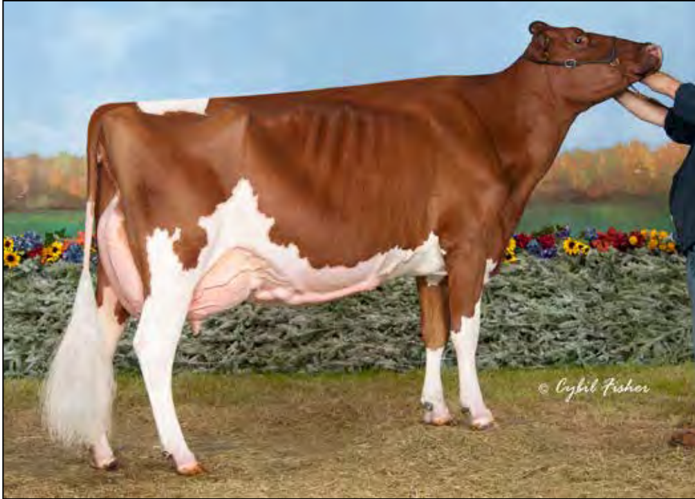
MS CANDY APPLE-RED-ET EX-94 EEEEE 2E 3RD DAM OF LOT 32