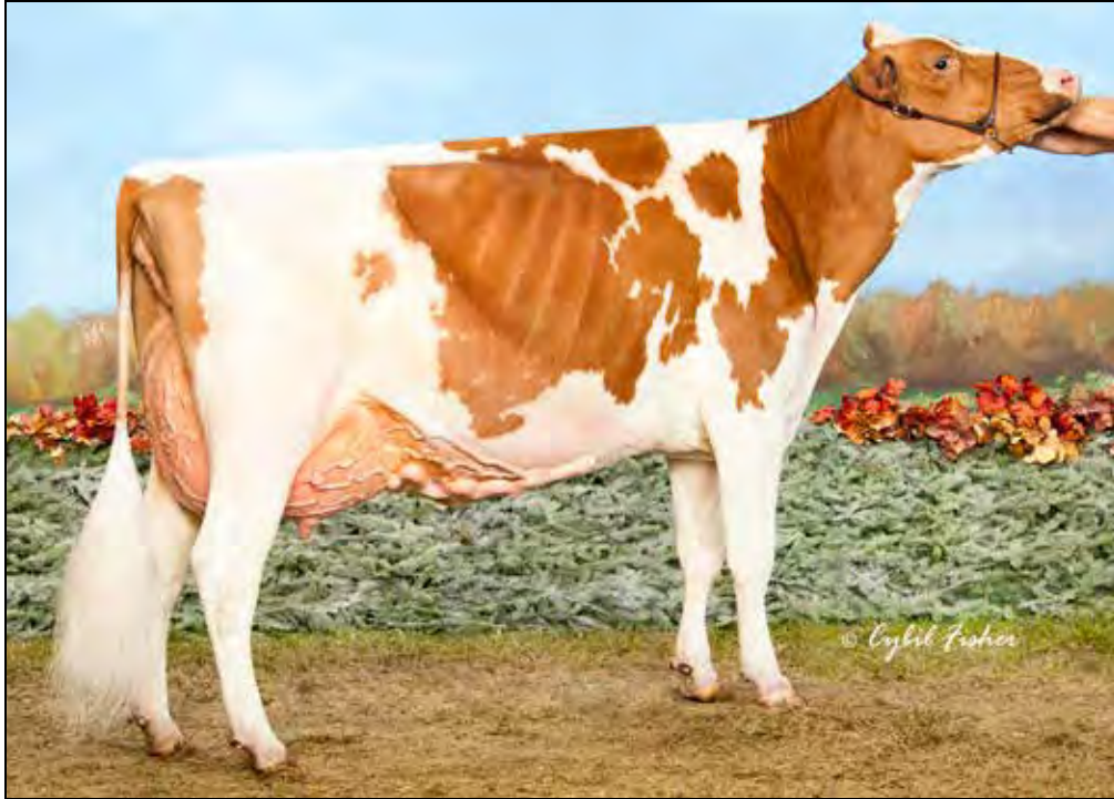
HEATHERSTONE REDHOT-RED EX-92 EX-MS DAM OF LOT 39