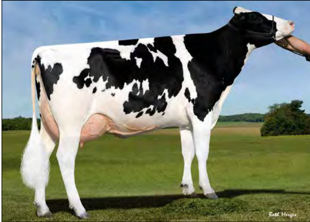
SANDY-VALLEY MORGAN ERA-ET GP-83 GMD DOM 3RD DAM OF LOT 27G