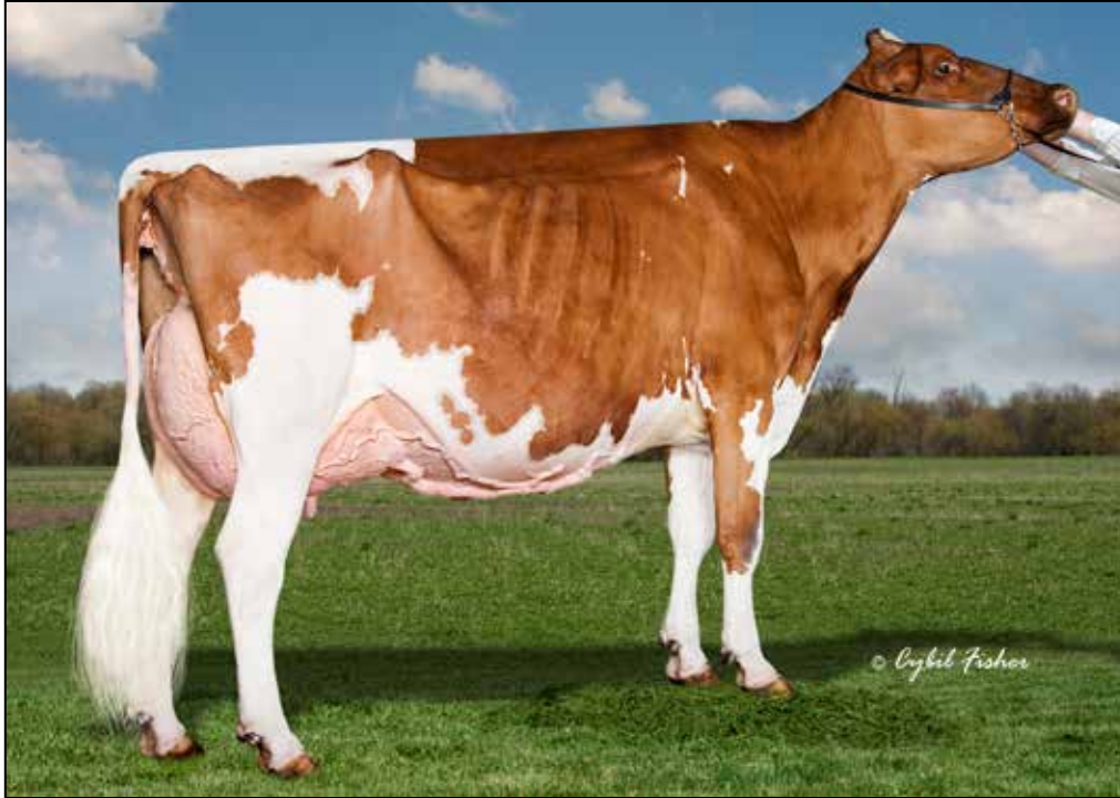
SHE-KEN APPLE DUMPLE-RED-ET EX-94 EEEEE 2E DAM OF LOT 25