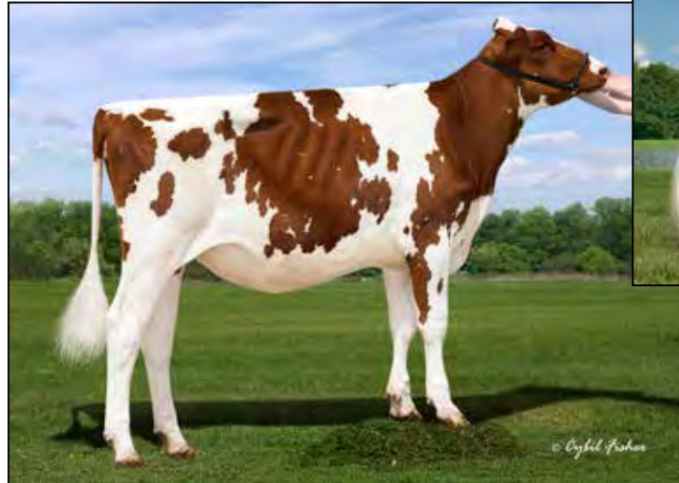
CASH-AL ARISTOCRAT THEA-RED SELLS AS LOT 44