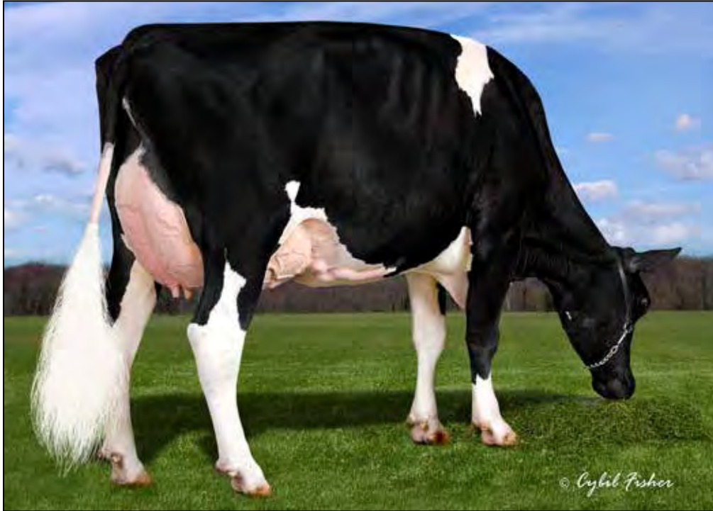
VIEW-HOME MRDIAN IOWA-ET VG-86 VG-MS DOM 3RD DAM OF LOT 33G