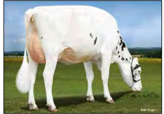
LADYS-MANOR GRNT OOHM-ET VG-85 DOM 2ND DAM OF LOT 4G