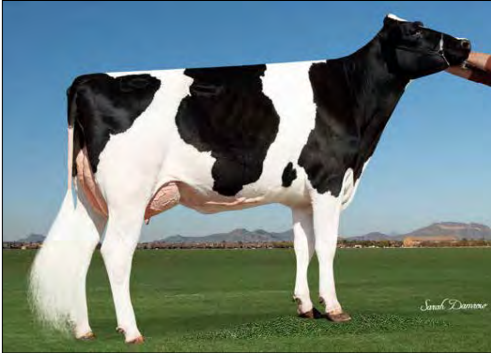
LORITA HONEYMOON VG-86 VG-MS DAM OF LOT F