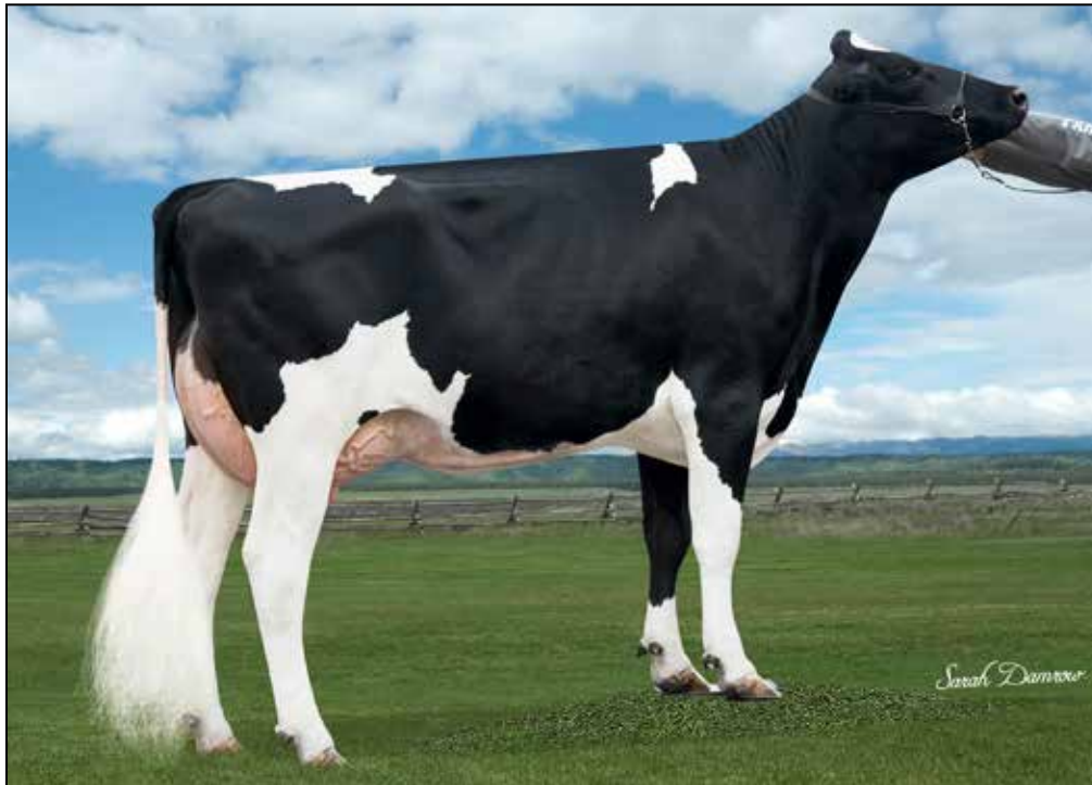
MS SEAGULLBAY JEDI CABBY-ET GP-80 VG-MS 3RD DAM OF LOT 10G