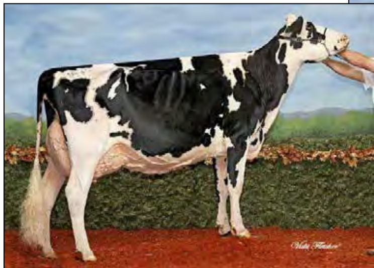
IDEE GOLDWYN LUCIA-ET EX-92-CAN DAM OF LOT 38