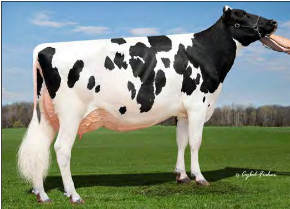
PEN-COL SILVER MIST-ET VG-88 VG-MS 3RD DAM OF LOT 18G