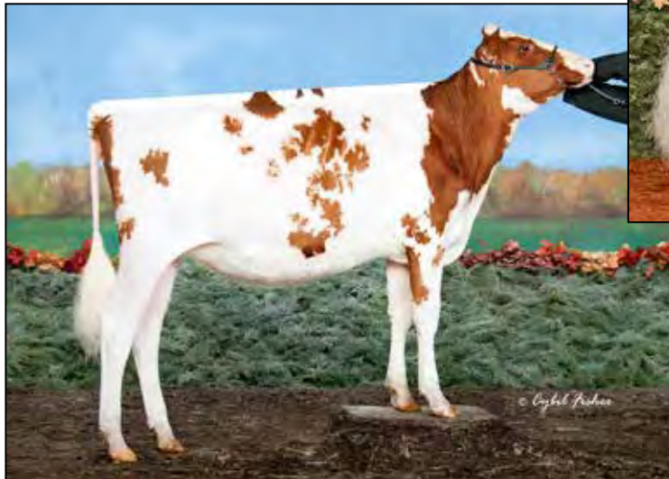
MS-AOL JORDY RAEANN-RED-ET FULL SISTER TO LOT H