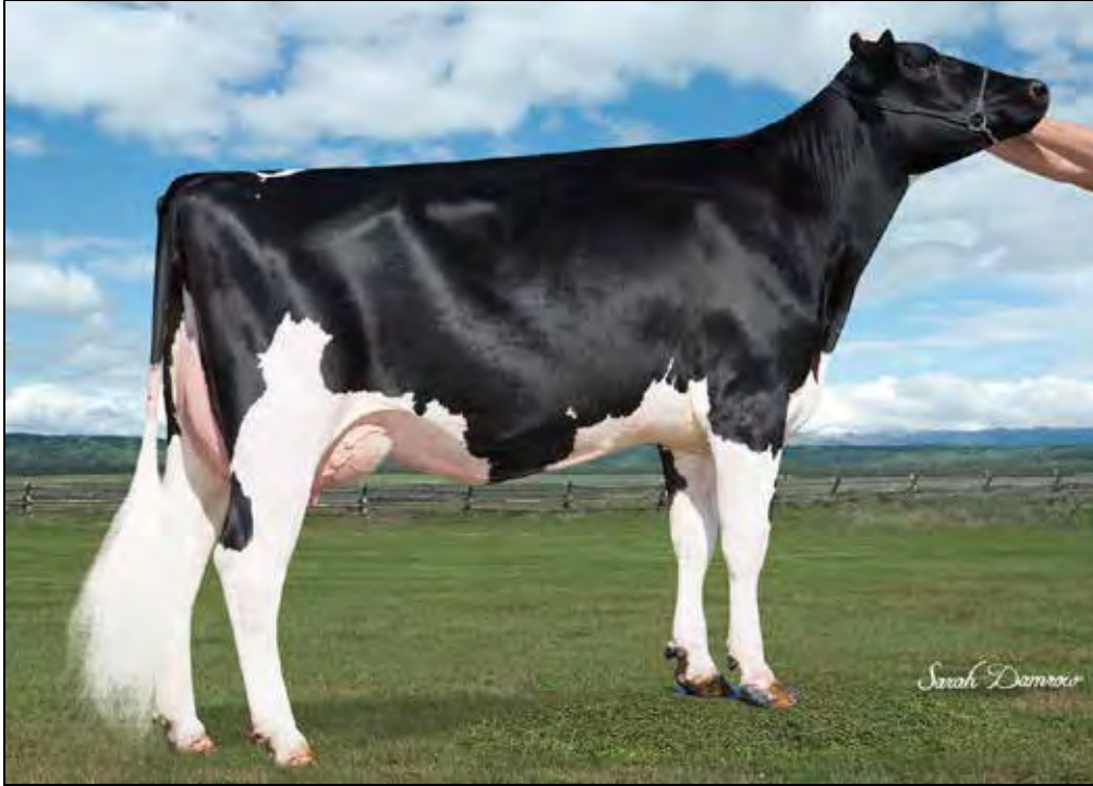
NO-FLA STOIC ANNE 40873-ET VG-86 VG-MS 3RD DAM OF LOT 20G