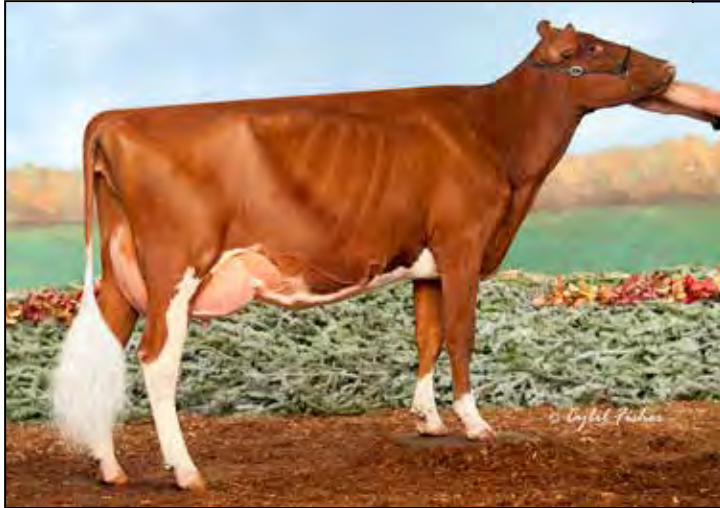
MS APPLE ANASTACIA-RED-ET EX-94 EEEEE DAM OF LOT 26