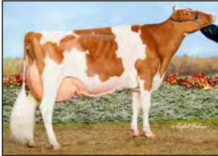
HILROSE ADVENT ANNA-RED-ET EX-95 EEEEE 3E GMD DAM OF LOT 19