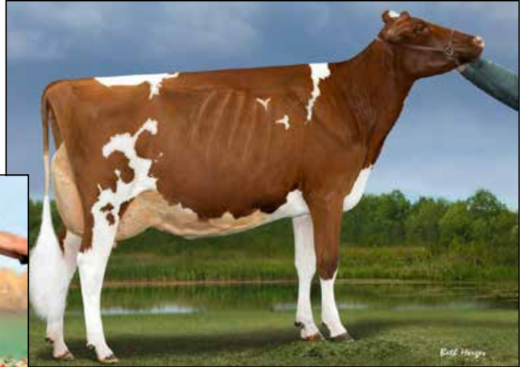
MS APPLE ANDRINGA-RED-ET EX-94 EEEEE FULL SISTER TO DAM OF LOT 26