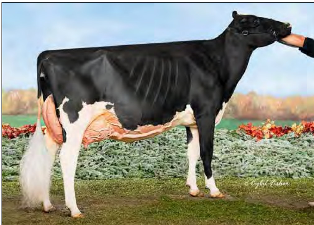
MS BEAUTYS BLACK VELVET-ET EX-92 EX-MS DAM OF LOT 14