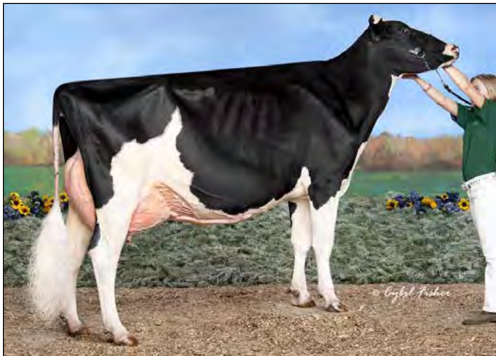
SAVAGE-LEIGH ATWD LIC-ET EX-93 EEEEE 2E DAM OF LOT 45