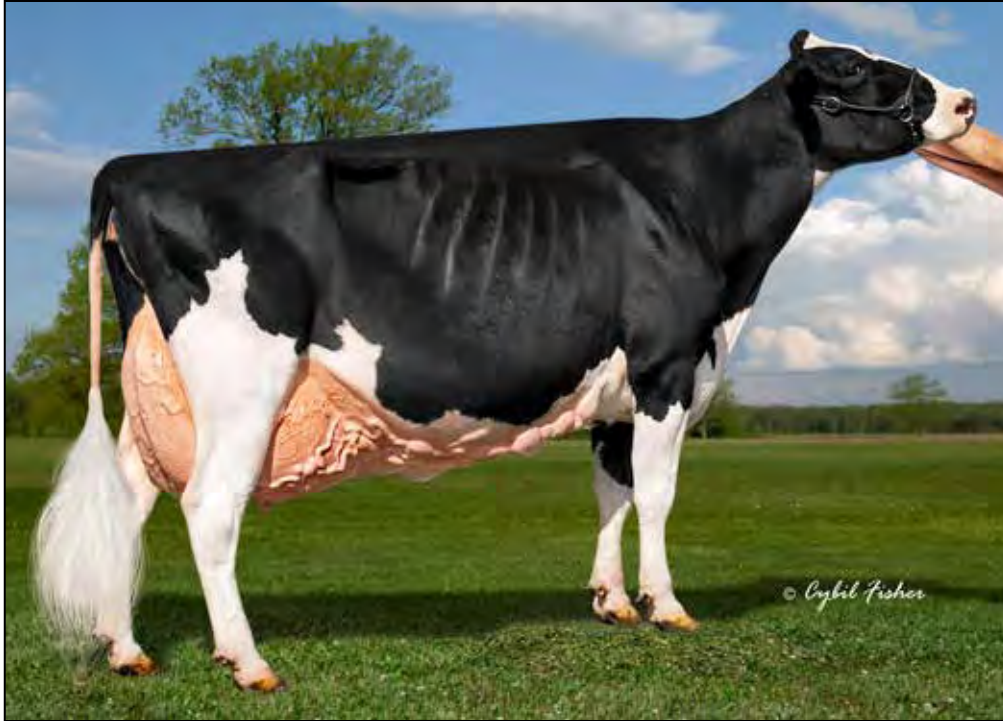
BLONDIN GOLDWYN SUBLIMINAL-ETS EX-97 EEEEE 3E DAM OF LOT D