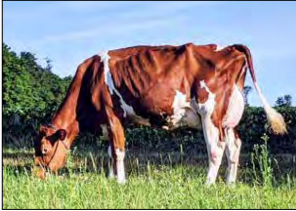
GOLDEN-ROSE BARBRITZI B-RED EX-90 EX-MS MATERNAL SISTER TO LOT 7