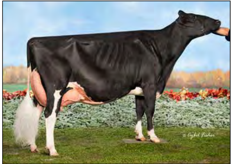
BUTZ-BUTLER GOLD BARBARA-ET EX-96 96-MS 3E GMD 3RD DAM OF LOT 15