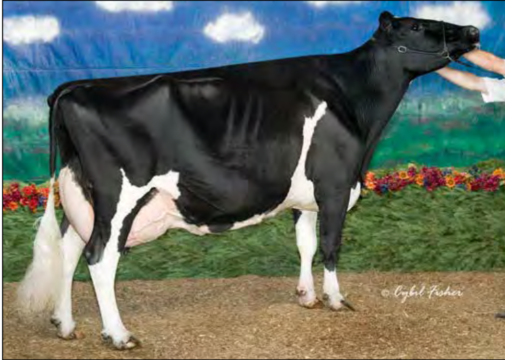
HILLMONT DURHAM LYNDI EX-96 EEEEE 5E 2ND DAM OF LOT 10