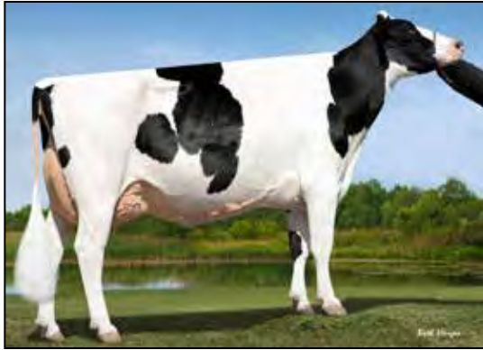
LADYS-MANOR DORCY ODA EX-93 2E DOM 4TH DAM OF LOT 4G