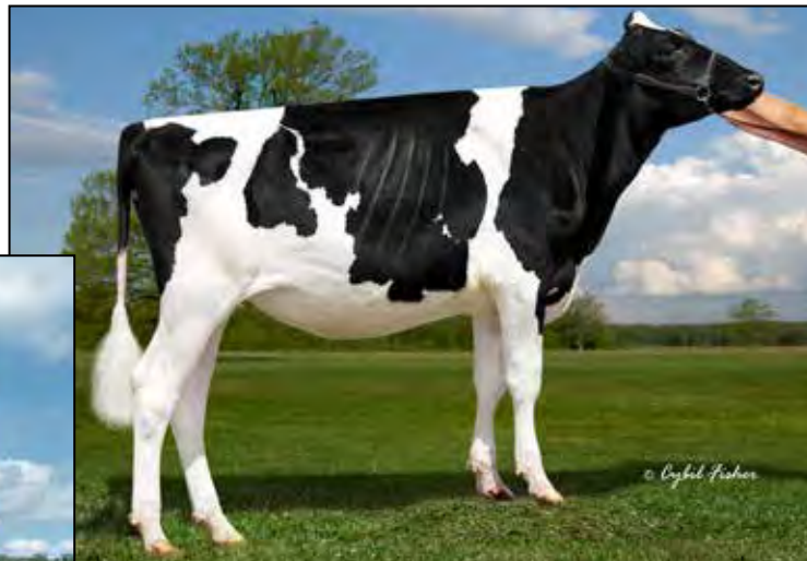
SUN-MAID CRAVE DOCTORATE-ET MATERNAL SISTER TO LOT 24