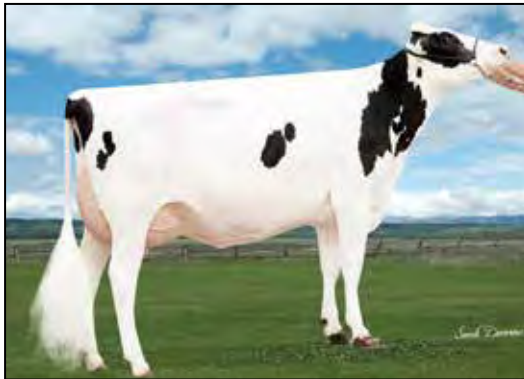
WINSTAR ACHIEVER MODEL-ET VG-85 VG-MS @ 2-09 2ND DAM OF LOT 23G