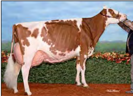
MISS APPLE SNAPPLE-RED-ET EX-96 EEEEE 2E DAM OF LOT 5