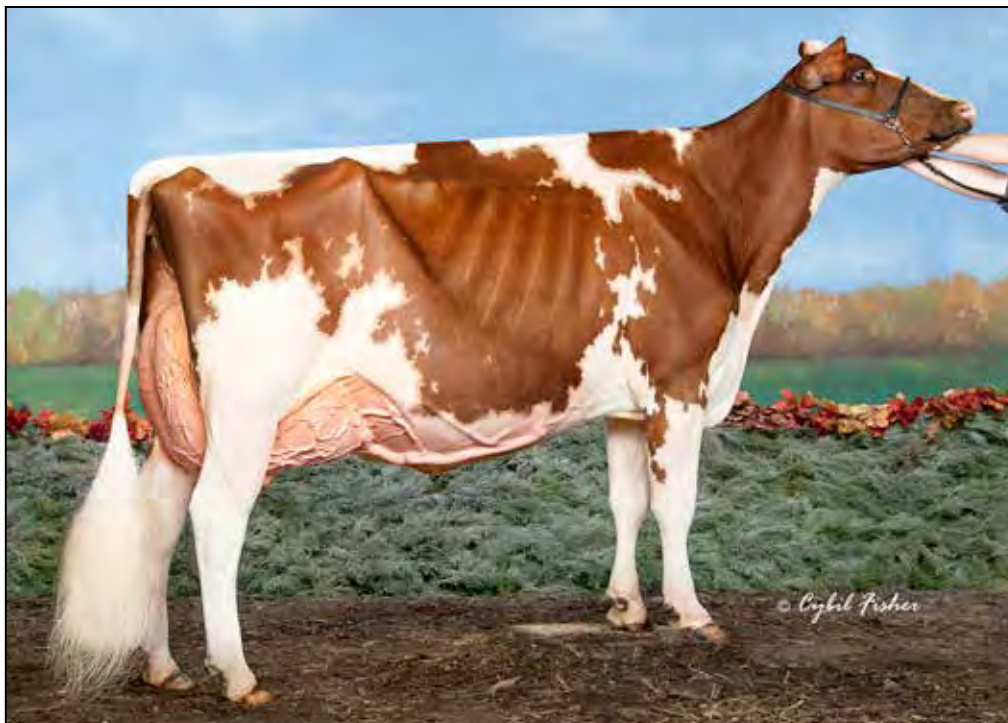
WIL-O-MAR DIAMNDBK ROSE-RED EX-92 EEEEE DAM OF LOT 42