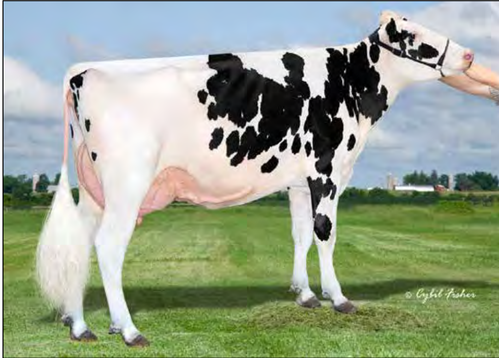
SHELAND DUKE DAYLILY-ET VG-85 VG-MS @ 2-08 DAM OF LOT 2G