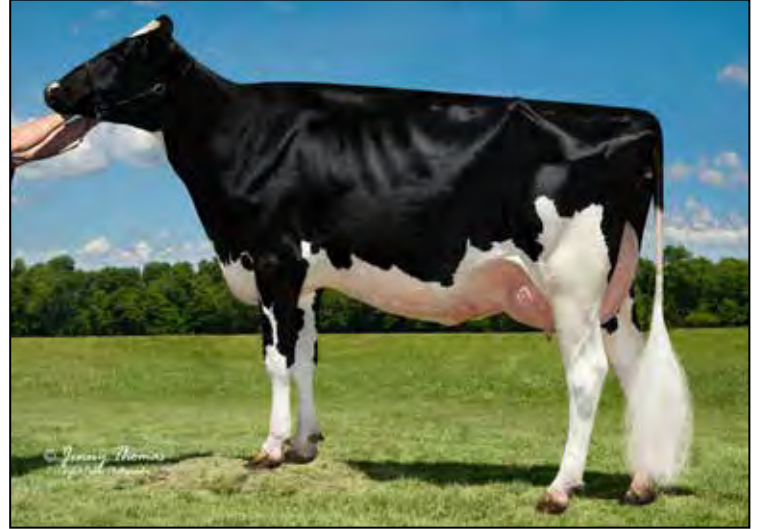
MISS N UNO AUTHORITY-ET EX-92 EEEEE DAM OF LOT 31