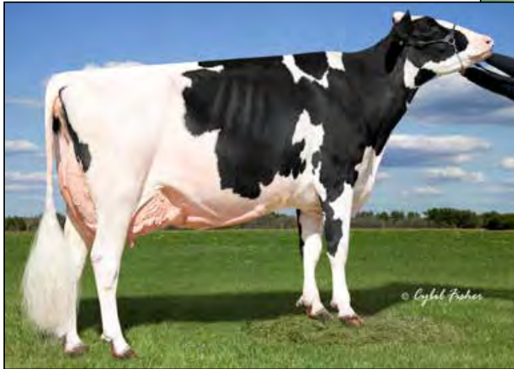
KINGS-RANSOM MG CLEAVAGE-ET EX-95 EEEEE DOM DAM OF LOT 33