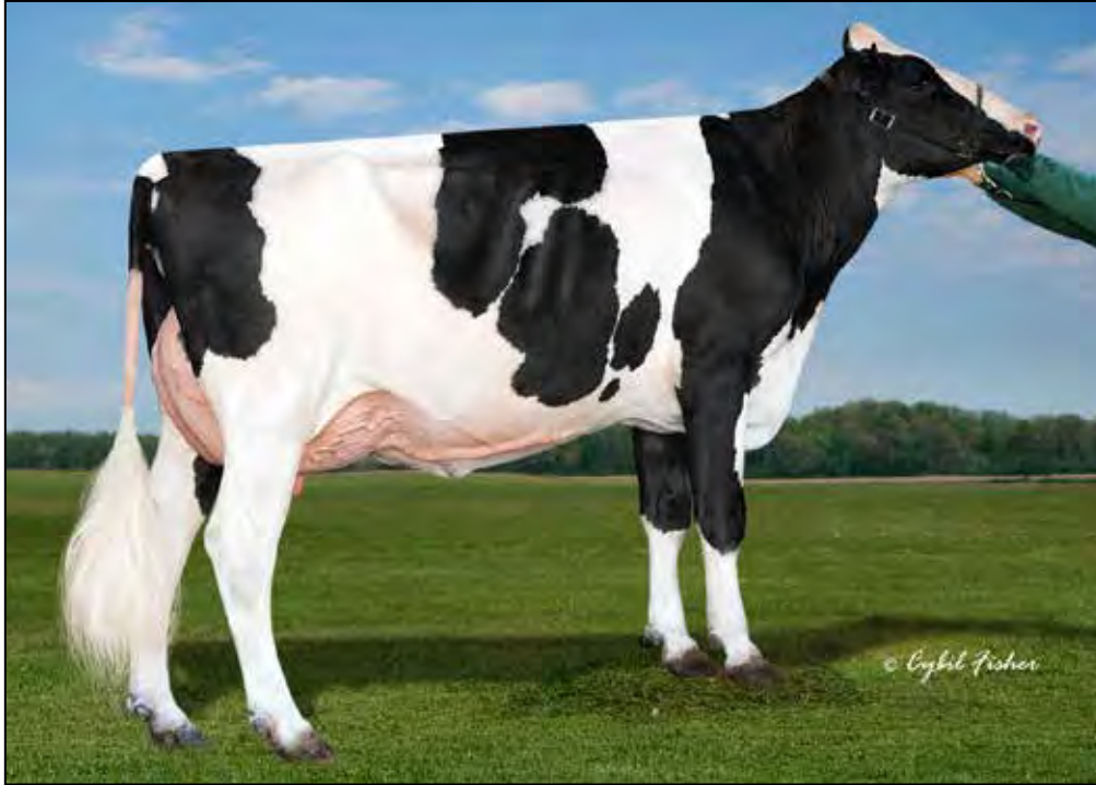
CHERRY-LILY MARIUS LIBBY-ET GP-83 VG-MS @ 2-04 2ND DAM OF LOT 13G