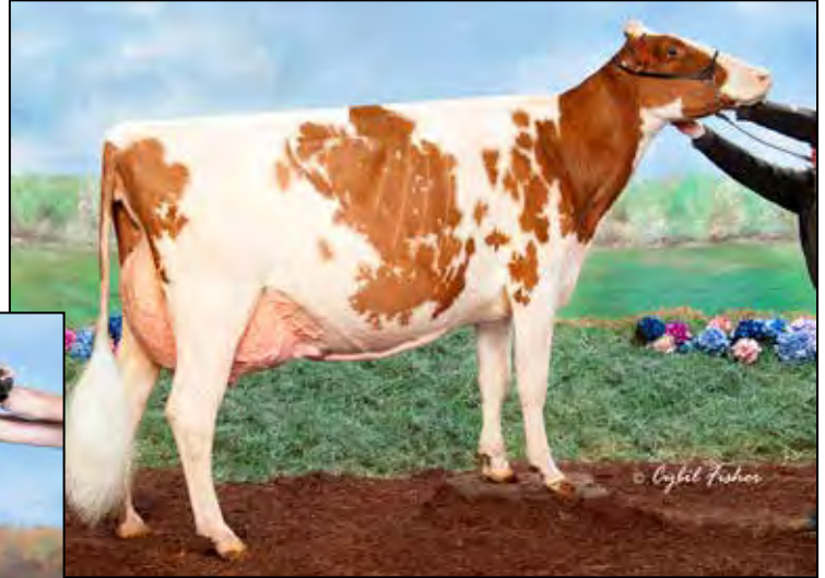
KEVETTA RDBURST LUCIOUS-RED EX-94 EEEEE DAM OF LOT L