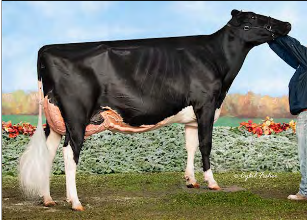
RUANN DOORMAN JEAN-55162-ET EX-92 EEEEE DAM OF LOT I