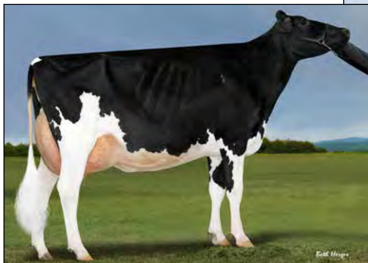
BUTLerview BRAZ CAMILLE-ET EX-94 FULL SISTER OF DAM OF LOT 48