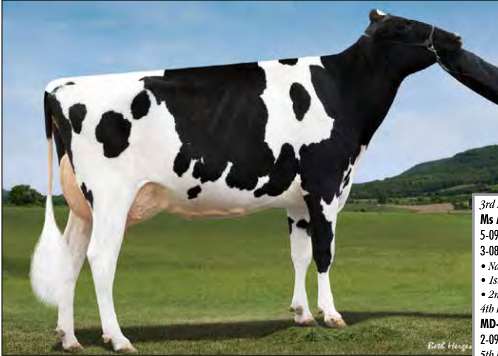
MAPLE-DOWNS ANNABELLE-ET EX-93 2E *PO DAM OF LOT 41