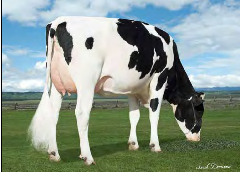
SEAGULL-BAY JEDI MIRAGE-ET VG-85 VG-MS 3RD DAM OF LOT 7G