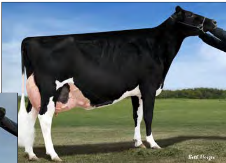
SILVERMAPLE DAMION CAMOMILE EX-95 EEEEE 2ND DAM OF LOT 48