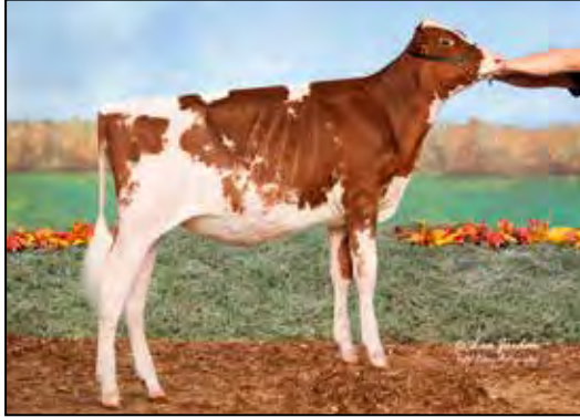
KOZY-KOUNTRY AFTER PARTY-RED-ET FULL SISTER TO LOT 31