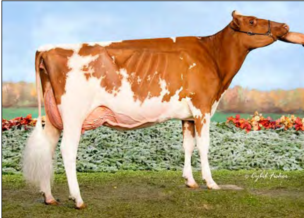
FLOWER-BROOK CORAL-RED-ET EX-93 94-MS DAM OF LOT N