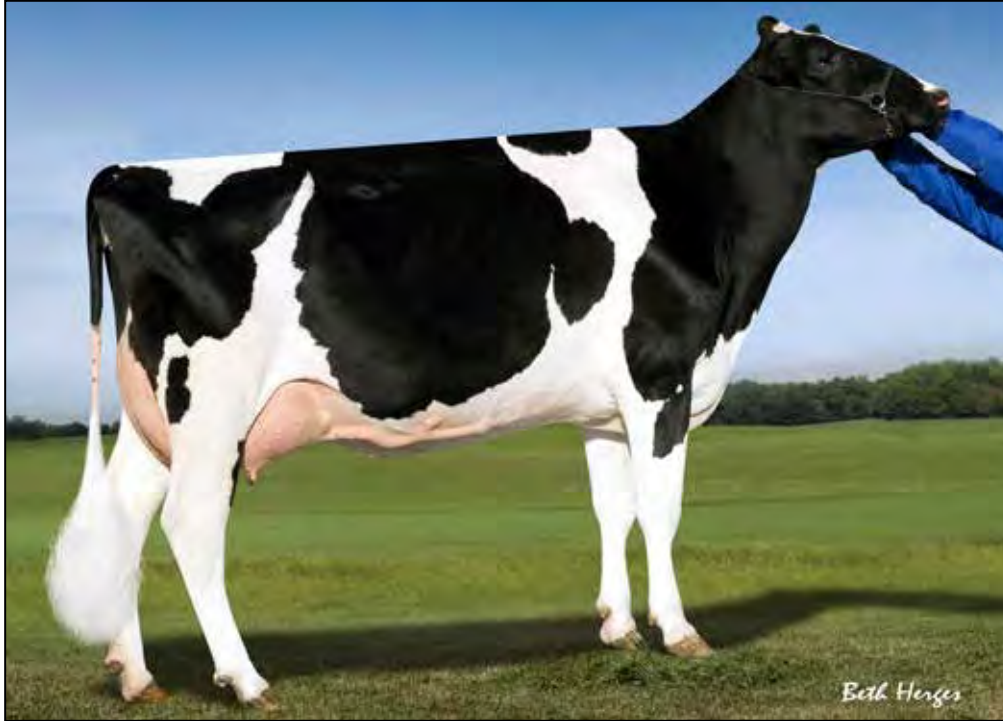
PINE-TREE 2149ROBST 4846-ET VG-86 VG-MS DOM 3RD DAM OF LOT 15G