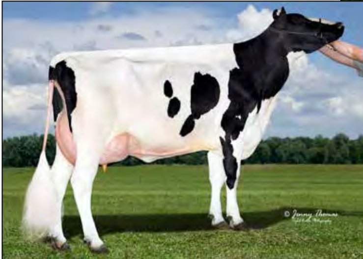
PENN-ENGLAND LEHIGH 13897 VG-86 VG-MS @ 3-03 2ND DAM OF LOT 1G