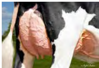
OUR-FAVORITE LUSTRE-ET VG-89 93-MS MAX DAM OF LOT 17