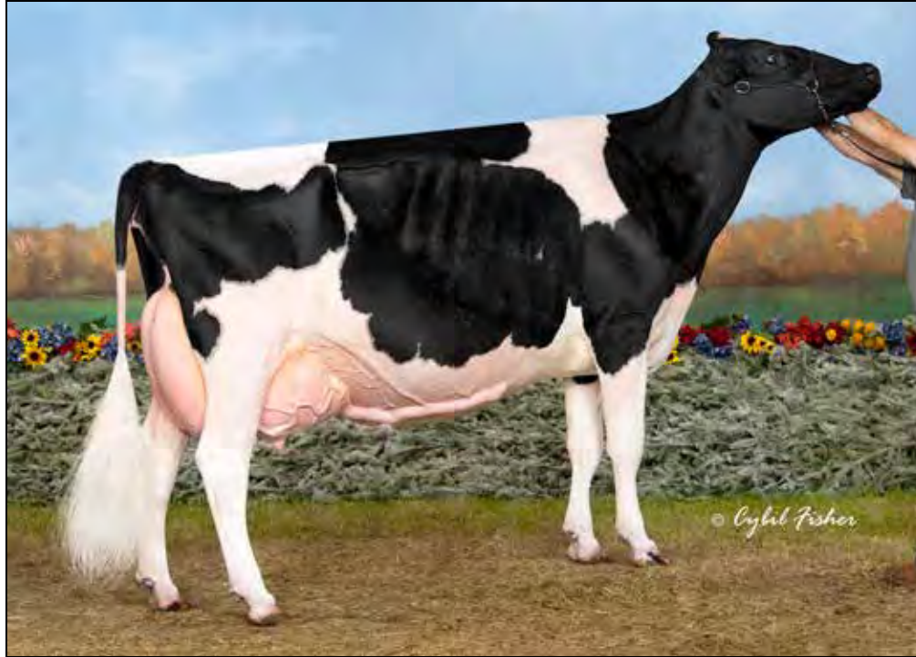
BUDJON-JK EMILYS EDAIR-ET EX-95 EEEEE 2E 2ND DAM OF LOT 46