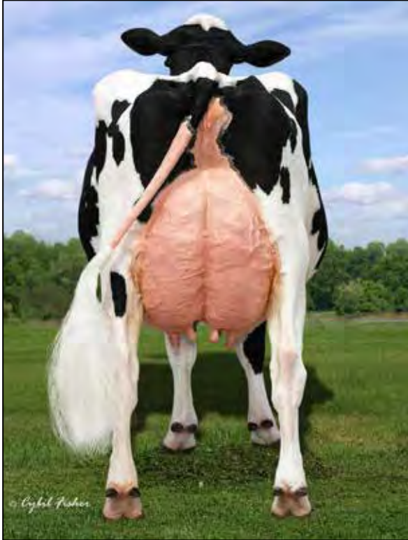
OAKFIELD SOLOM FOOTLOOSE-ET EX-94 98-MS DAM OF LOT 13