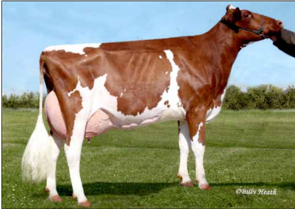
SRP ABSOLUTE FANTASY-RED-ET EX-94 EEEEE 2E DAM OF LOT 54