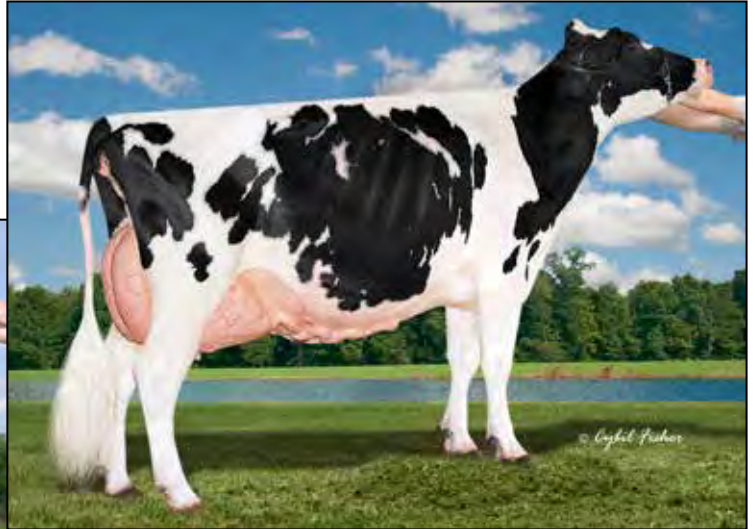
PENCROFT AFTERSHOCK TISHA EX-94 2E 2ND DAM OF LOT 44