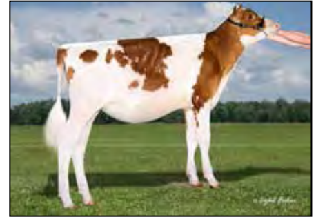
HILROSE ALTITUDE AUDI MATERNAL SISTER TO LOT 19