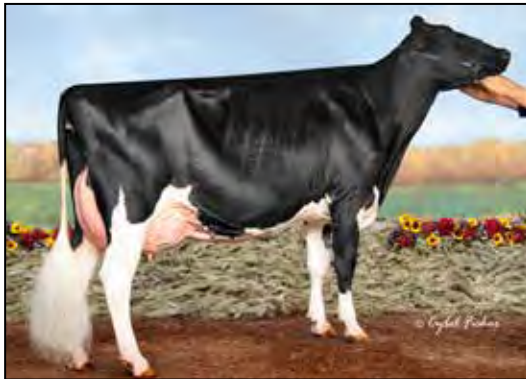
TUYTEL ATWOOD BARBARA-9-ET EX-94 2ND DAM OF LOT 15