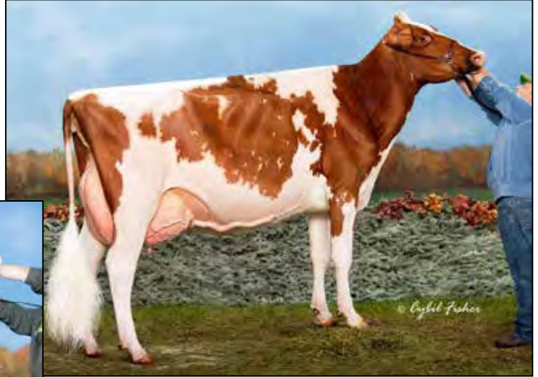
GREENLANE DESTRY LAUREL-RED EX-93-CAN 93-MS FULL SISTER TO LOT 60