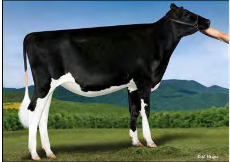
MILKSOURCE DIAMOND SHADE-ET SELLS AS LOT 5