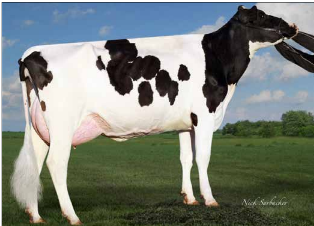
DEN-K BOOKEM BROOKE 524 VG-88 VG-MS 5TH DAM OF LOT 36G