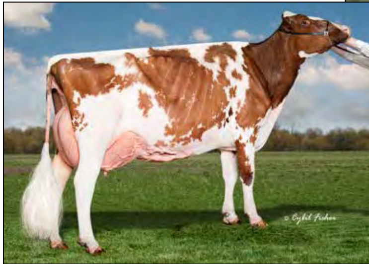
COLGANADOS D AVIANCA-RED-ET EX-95 EEEEE 2E DAM OF LOT 6