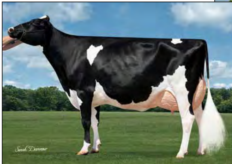
COMESTAR LARION GOLDWYN EX-95 EEEEE 2E DAM OF LOT 24