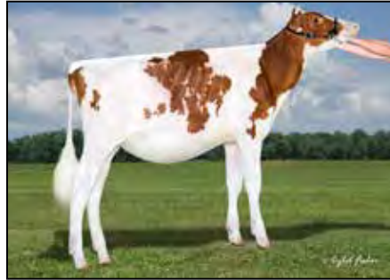
HILROSE ALTITUDE AERO MATERNAL SISTER TO LOT 19