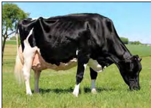
ROSIER BLEXY GOLDWYN-ET EX-97 EEEEE 3E 2ND DAM OF LOT 9