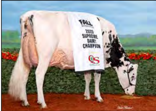
ERBACRES SNAPPLE SHAKIRA-ET EX-95-CAN 95-MS MATERNAL SISTER TO LOT 5