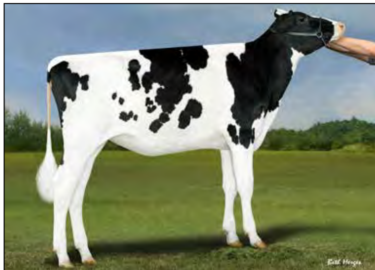
BUDJON-VAIL BLACK VELVET-ET SELLS AS LOT 9