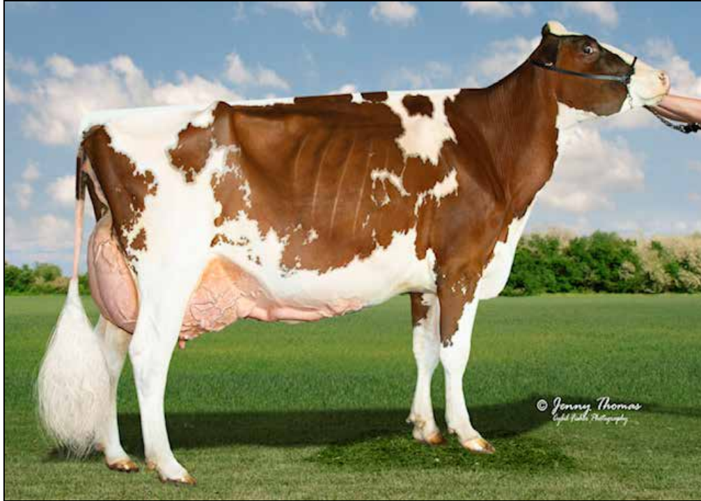
CHERRY-LOR LADD RIPPLE-RED EX-95 EEEEE 2E DAM OF LOT A