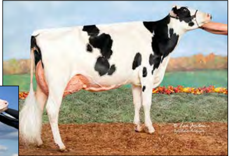
KINGS-RANSOM MONTRY CANS-ET EX-94 MATERNAL SISTER TO LOT 33