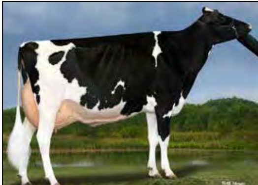
MISS UNO ARMANA-ET EX-94 FULL SISTER TO DAM OF LOT 31