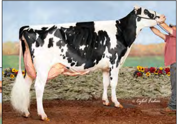
KEYSTONE ATWOOD ASHLEY EX-93 EX-MS 3RD DAM OF LOT 51