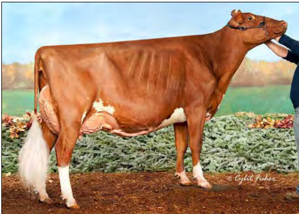
OAKFIELD A SHAMPAGNE-RED EX-94-CAN 2E MATERNAL SISTER TO LOT 40