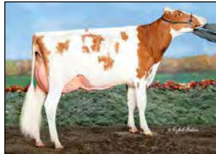
HILROSE AVALANCHE ADEL VG-88 MATERNAL SISTER TO LOT 19