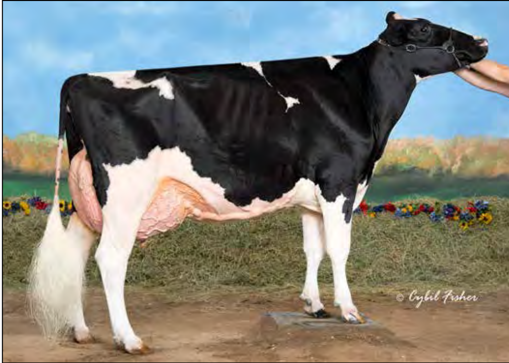
INDIANHEAD REDCARPET TIA-ET EX-94 EEEEE 3E DAM OF LOT 16