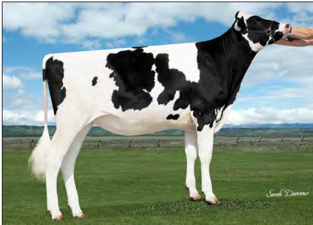
WINSTAR SOLUTION 6040-ET DAM OF LOTS 19G & 30G