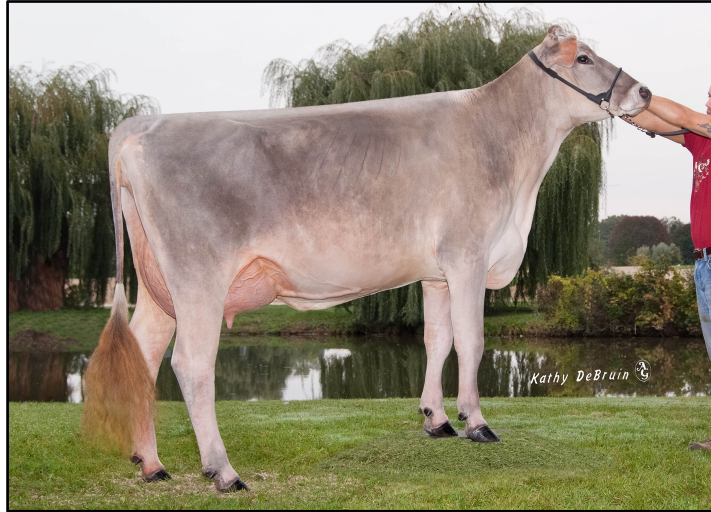
Just So T Sundrop EX90