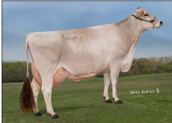
Cutting Edge Legacy Suntan EX92